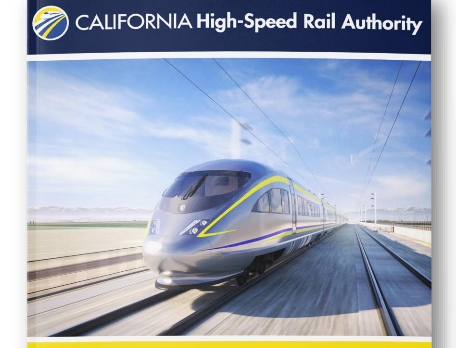
2020 BUSINESS PLAN