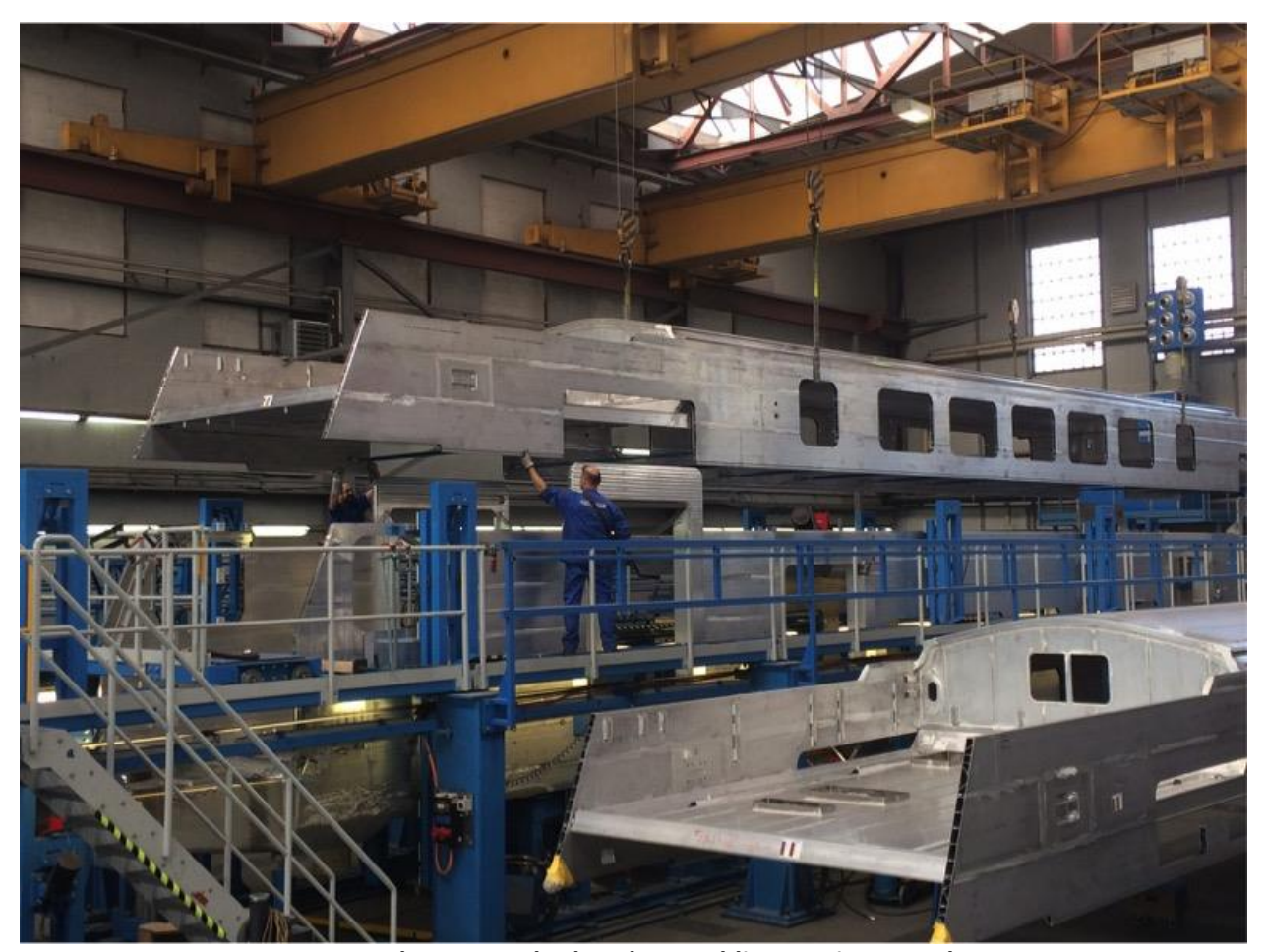
Upper and Lower Carbody Subassemblies Coming Together

View more pictures at <a href="CalMod.org/gallery">CalMod.org/gallery</a>.