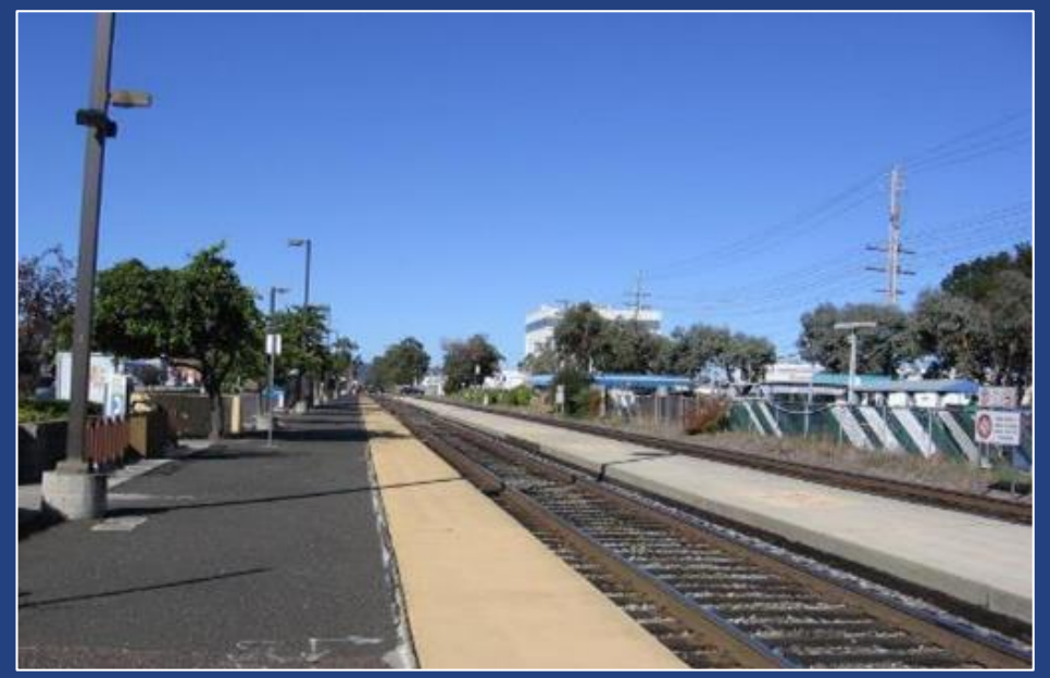
Example of "hold-out rule"