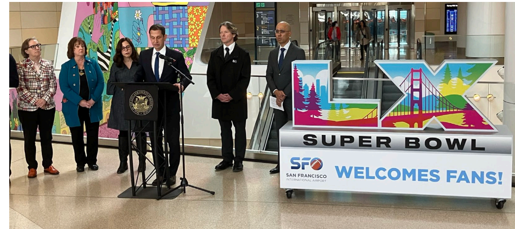
Press conference with SF Mayor Lurie at SFO re: transit coordination