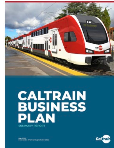
Caltrain Business Plan, 2017-2020 (report published 2022)

It is used by Caltrain and its partners to guide long-term decision-making for service and infrastructure on the Caltrain corridor.