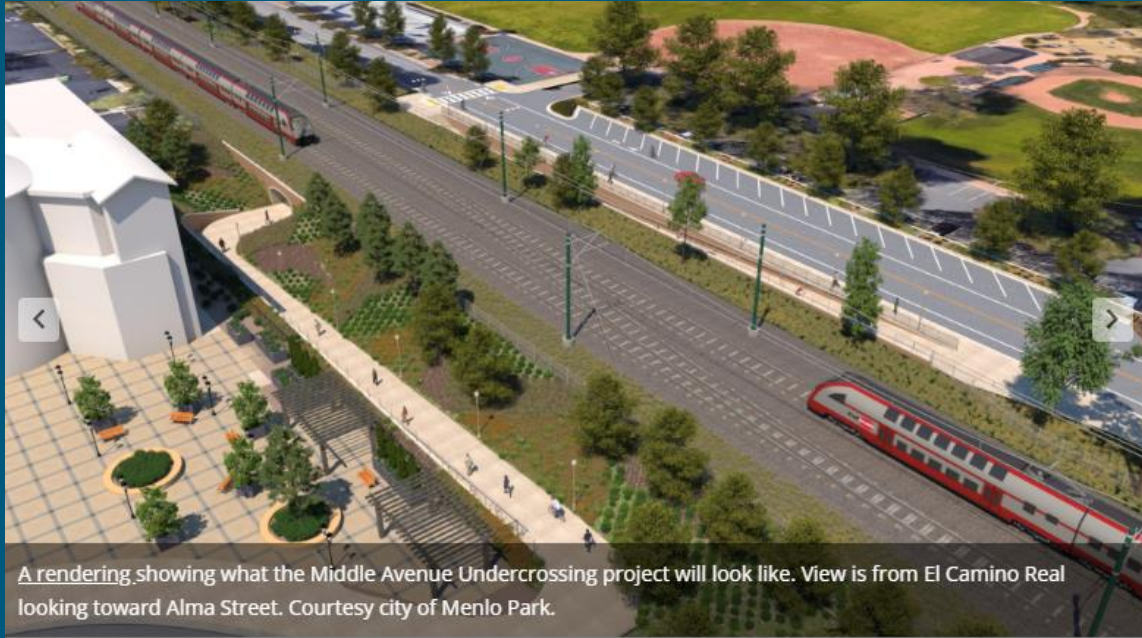
A rendering showing what the Middle Avenue Undercrossing project will look like. View is from El Camino Real looking toward Alma Street.