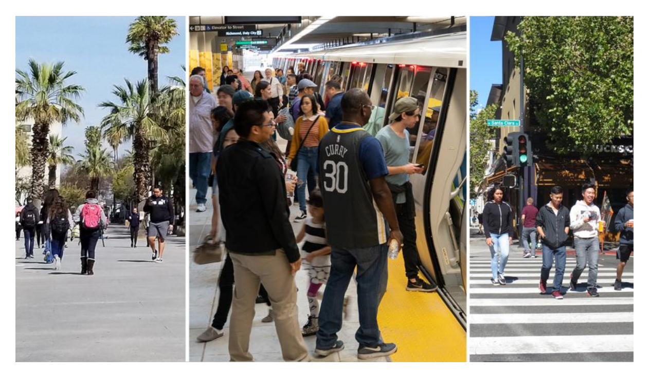
2023 Silicon Valley Bus and Light Rail Ridership is up 25% Over 2022

VTA's transit ridership recovery since the COVID pandemic is among the highest in the nation, including a 25% overall year to-date increase from 2022 to 2023. As VTA ridership hovers around 72% of pre-pandemic numbers, there is increasing confidence that VTA's BART Silicon Valley Phase II Extension project will be a further boon to transit ridership.