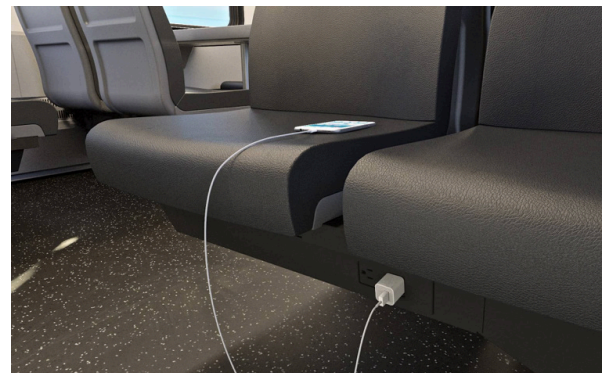
Power sources at every fixed seat