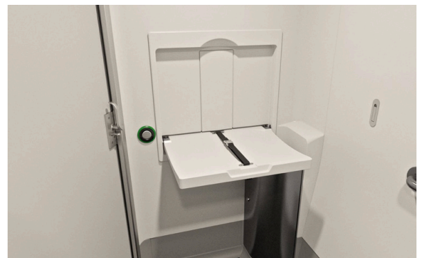
Onboard restrooms with baby-changing stations