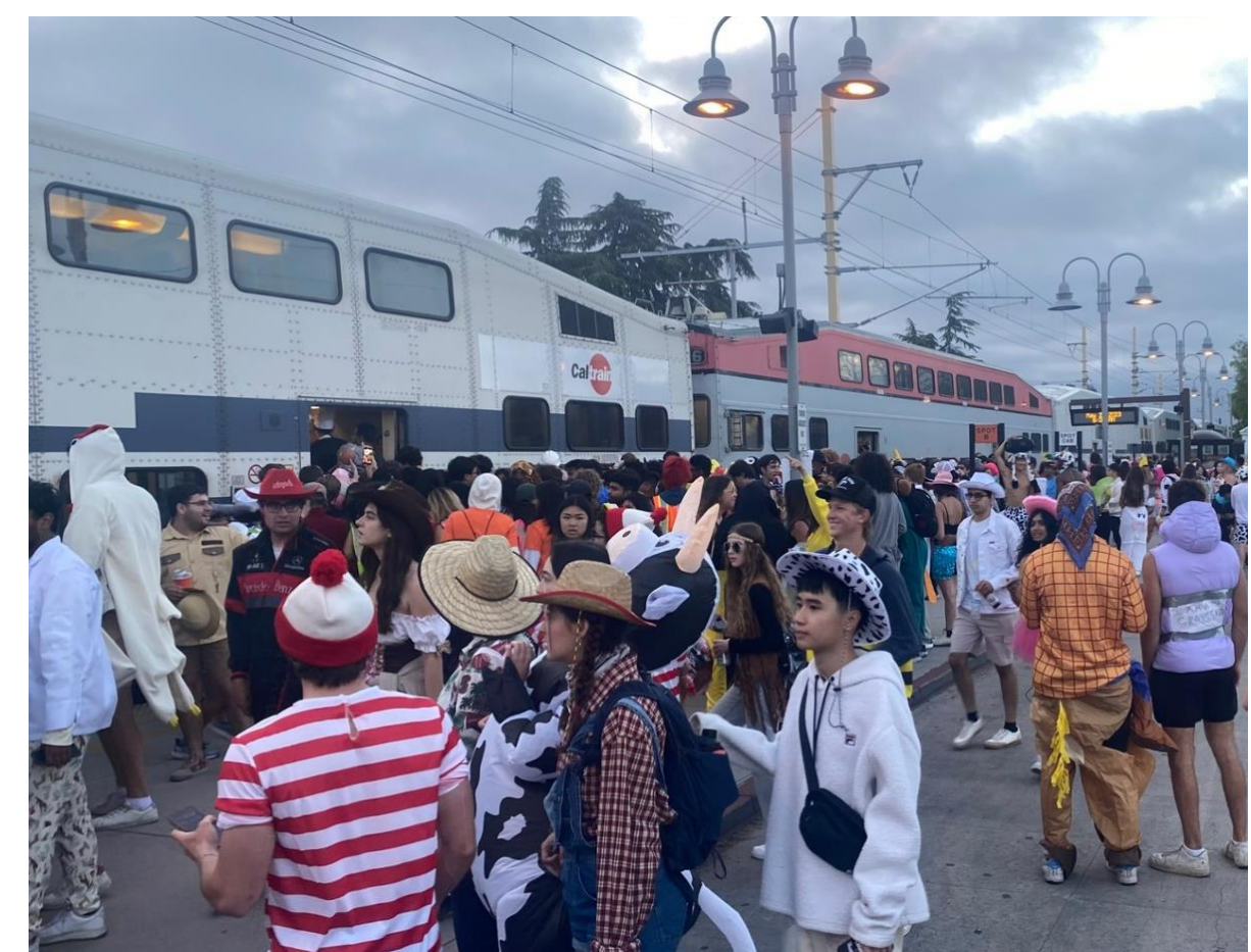
May 21, 2023 Bay to Breakers Caltrain Special Service