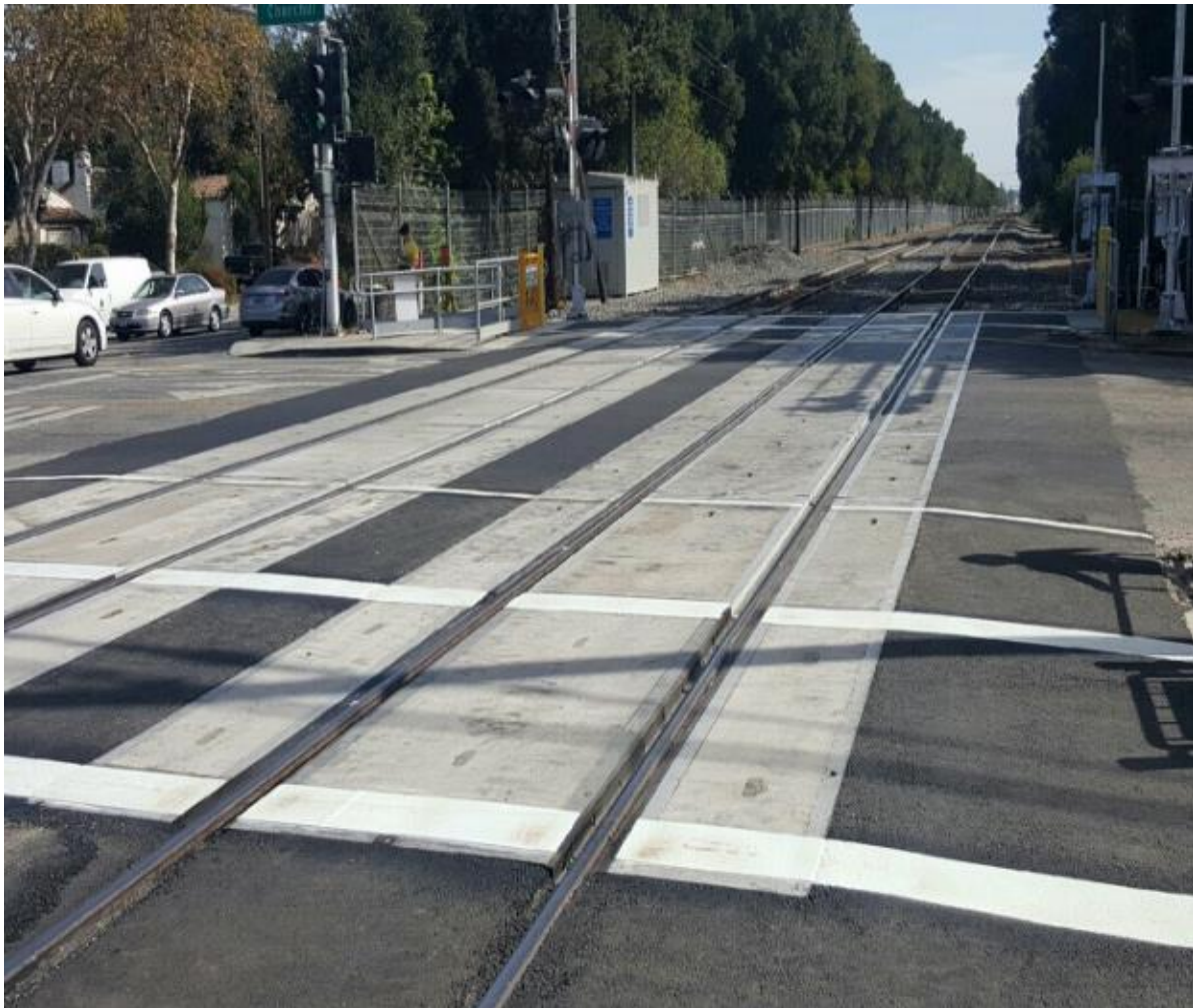
The reconstructed Churchill Avenue Grade Crossing