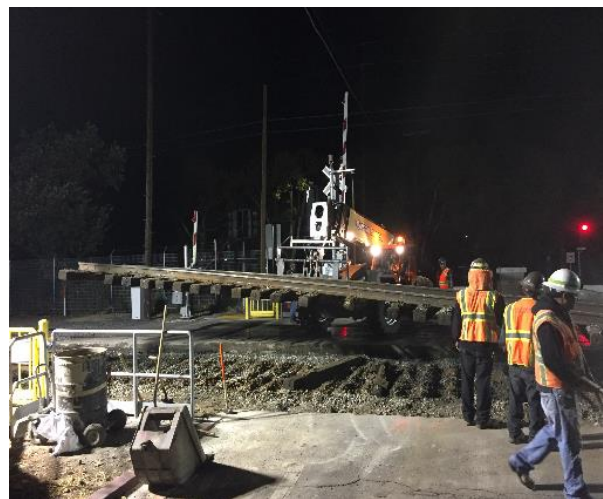
rail and ties removed