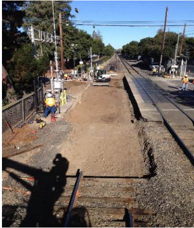
Track removal complete,