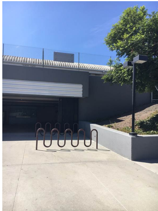
Newly painted the main entrance to the station