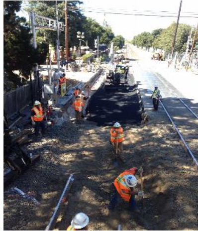
new hot mix asphalt,