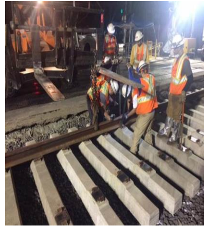
ties and rail installed