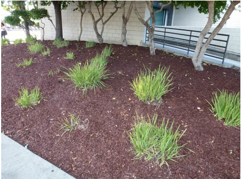
Added new mulch throughout the station