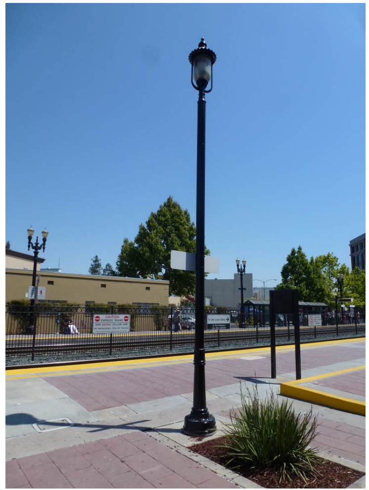
All the light poles were repainted