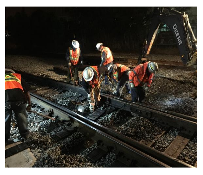
Crews replacing worn switch ties near Control Point (CP) Bird at San Jose Diridon Station