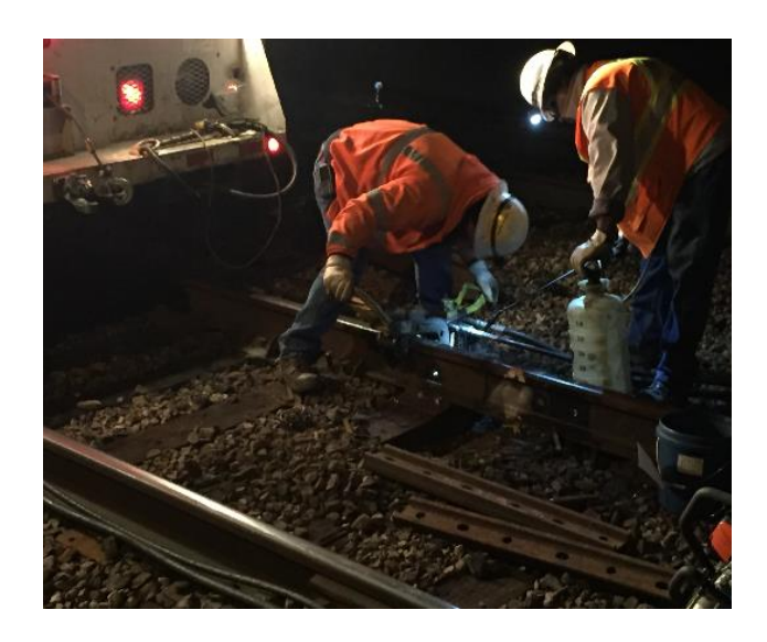
Joint Bars used temporarily to repair the rail defect.