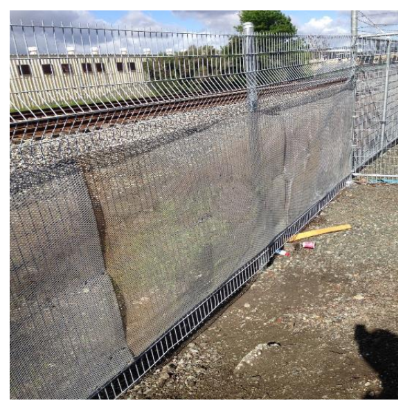
Crews reinforcing existing fence below Curtner Avenue, and the completed fencing

Trimmed trees at 41 locations including San Francisco (below) where the tree was blocking the Signal