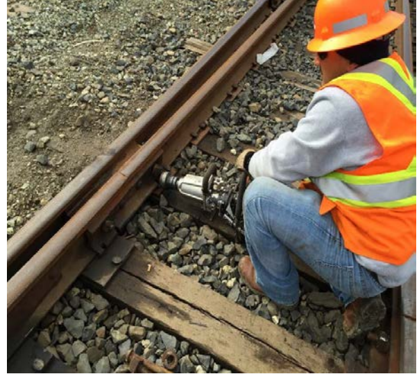
Replaced torch cut bolts with new bolts, washers & nuts