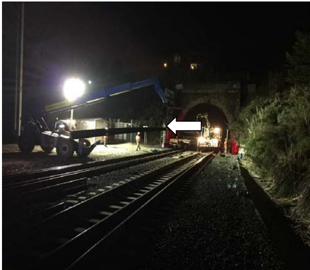
Unloaded new switchpoint before installation at CP Tunnel