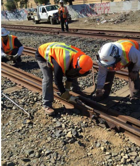
Torch cutting frozen bolts in SSF Yard