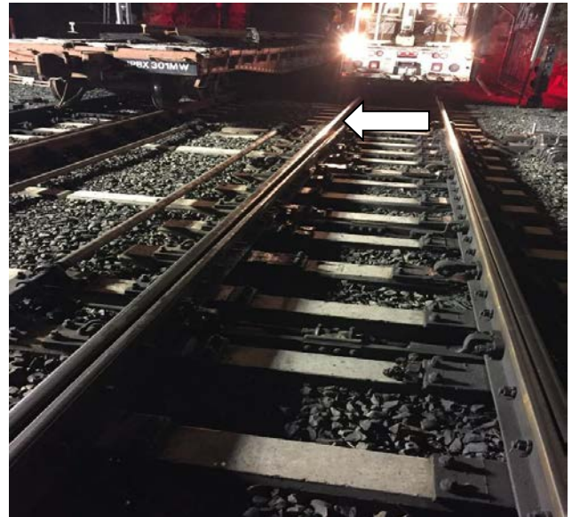
Replaced stock rails at CP Tunnel Stations