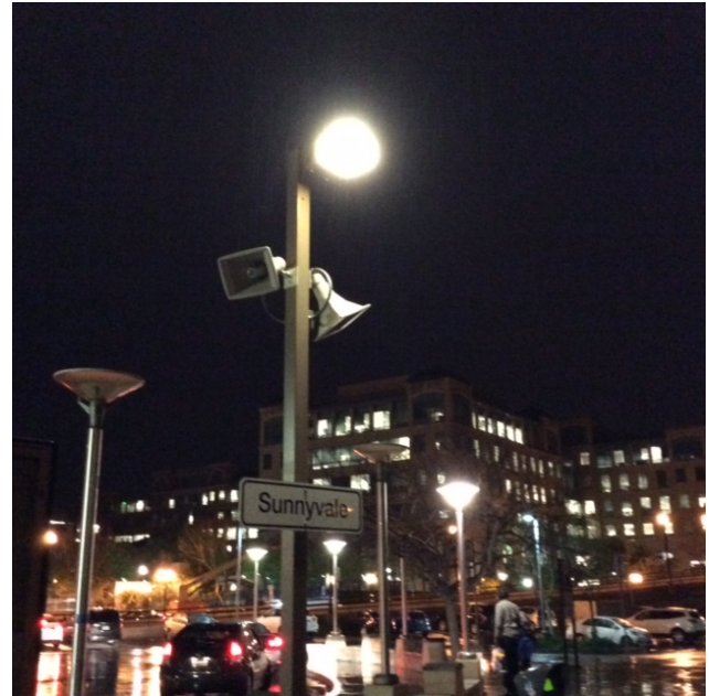
Replaced 17 existing ballast and lights with Light Emitting Diode (LED) lights along the platform at Sunnyvale station; LED lights are now furnished with ballast and this will simplify future replacements.