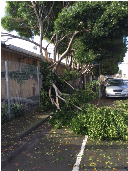
Removed a tree that fell on the Crew Facility at 5 th Street & Townsend in San Francisco.