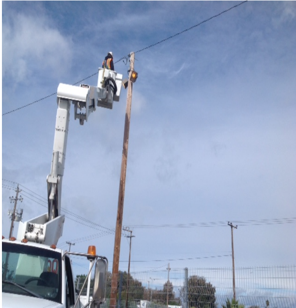
Repaired lights north of Hayward Park station along pathway on the west side