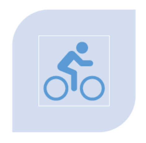
Improve safety for all modes