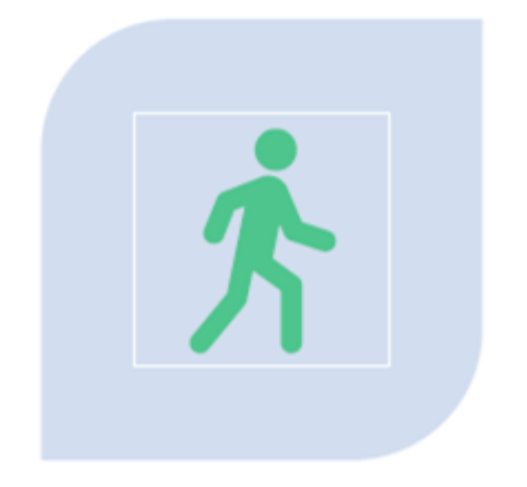
Support the pedestrianization of Downtown