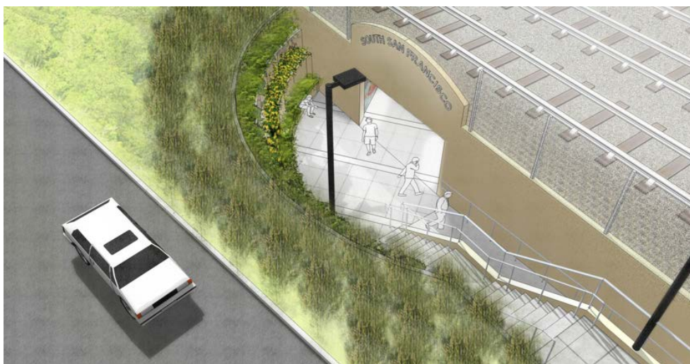
Renderings of East Station Access - Poletti Drive