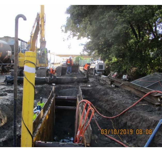
18 inch water main East side UPRR track