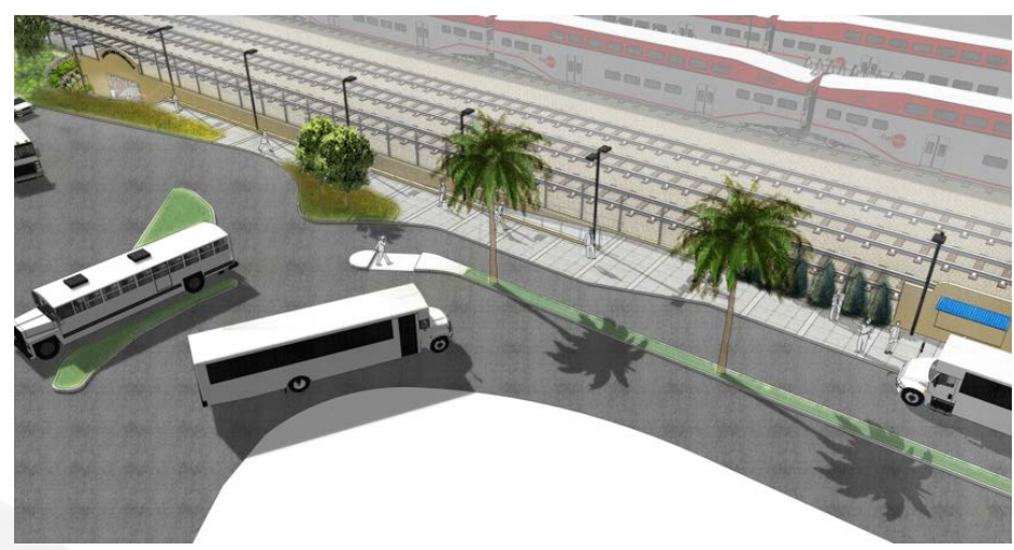
Renderings of Shuttle Drop off Area - Poletti Drive