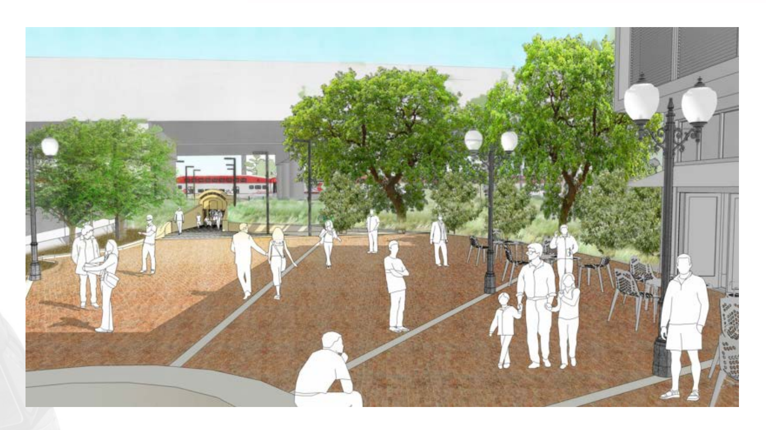
Renderings of West Plaza - Station Access