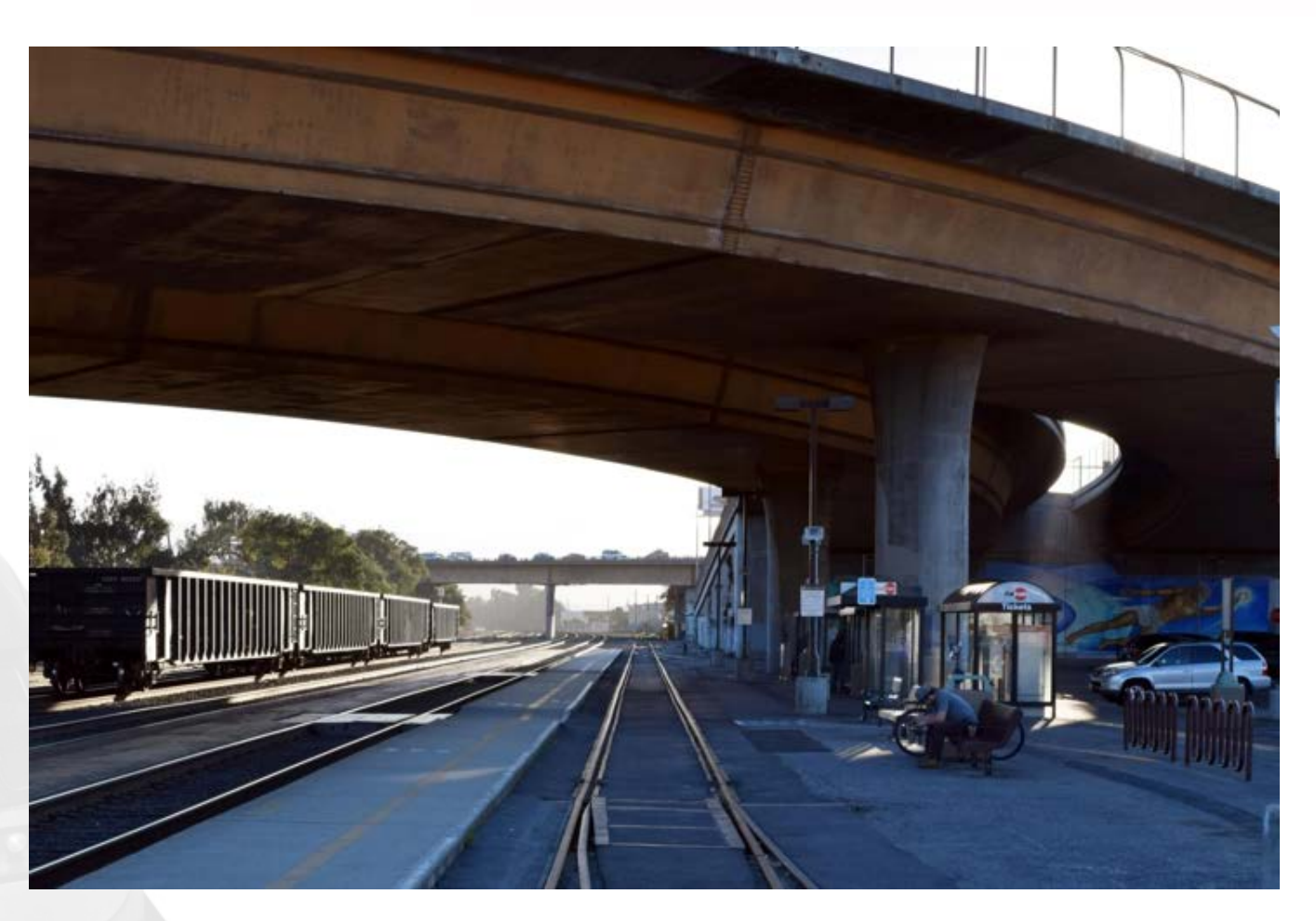
Existing Platform - South San Francisco Station Boarding