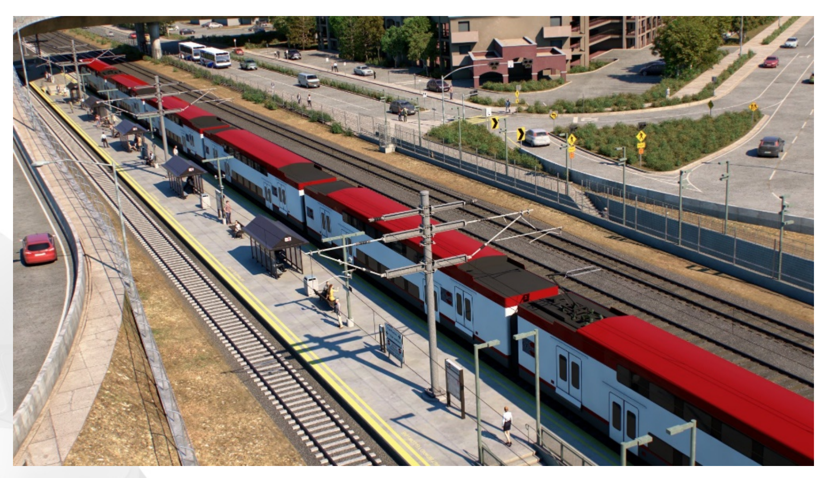
Renderings of Center Platform – Looking North