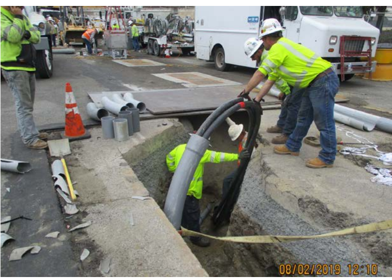
Routing from Splice box to termination point