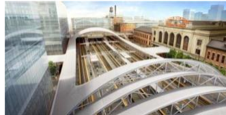
Denver Union Station, USA (construction)