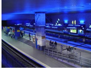
Essen Central Station, Germany