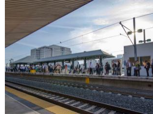
L.A. Union Station, USA