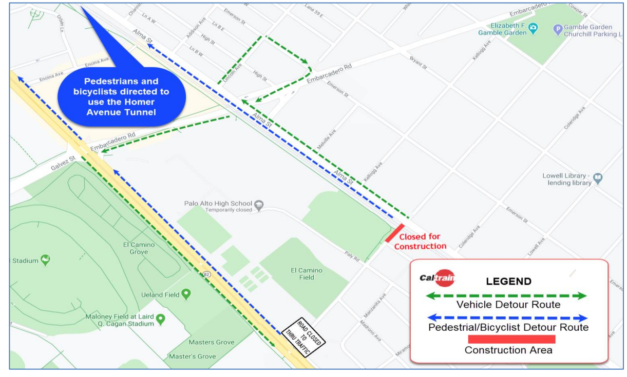
SOUTH DETOUR ROUTE (SOUTH OF CHURCHILL AVENUE)