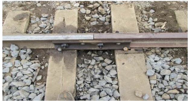
new ties and rail replaced