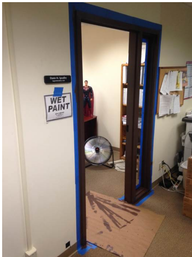
Facility maintenance - painted 37 interior doors & frames at Menlo Park facility