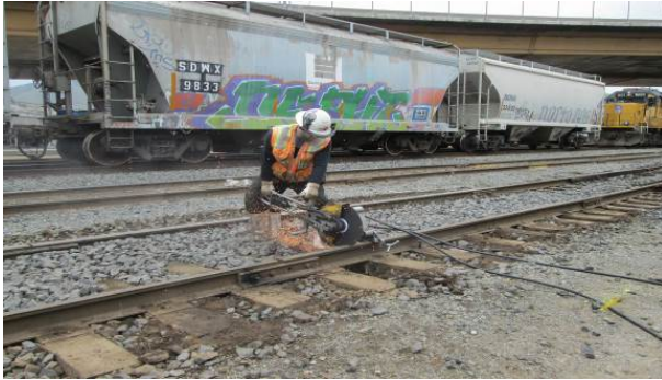
Cutting out the defective rail