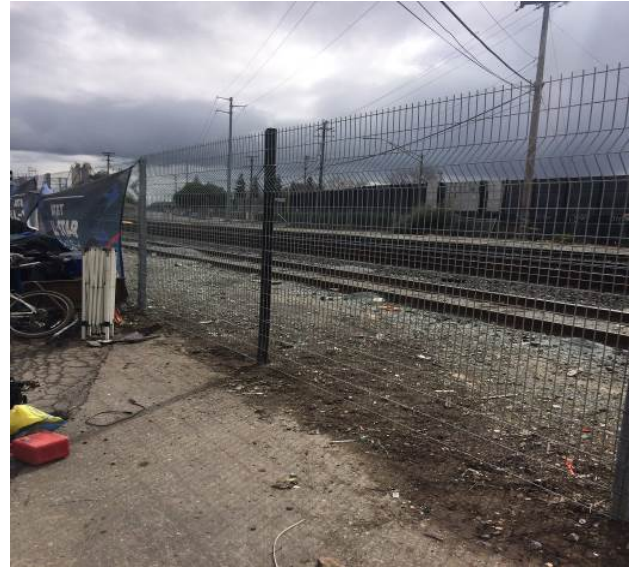
Replaced damaged fence posts and fabric