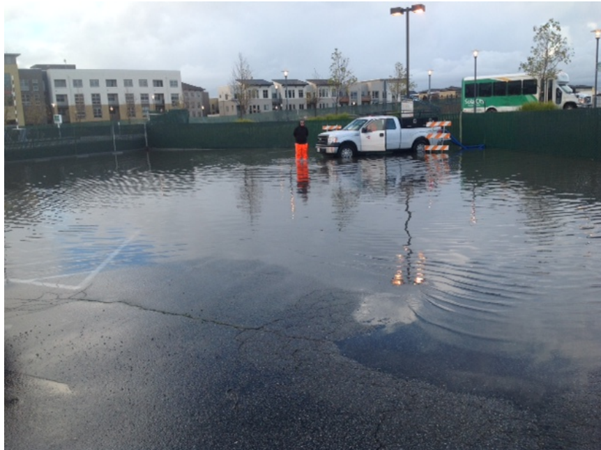
Continued pumping water out of Hillsdale east side parking; Bay Meadows contractor construction work has created a problem at this leased area