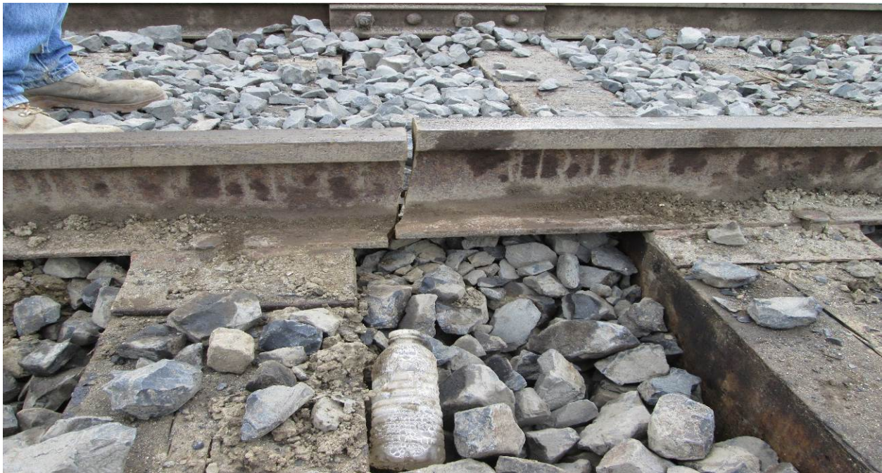
Broken rail found on Track 3 in South San Francisco Yard

Track safety inspection resulted in finding a broken rail in the South San Francisco yard: