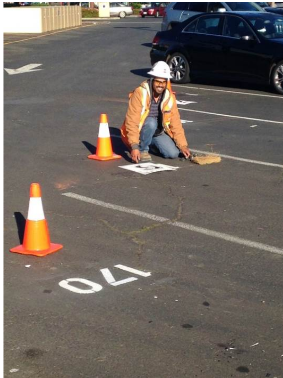
Continuous improvement - repainting numbers in our stations' parking lots