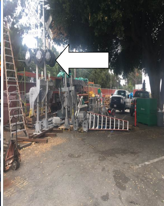
Replacement gate ready in Menlo Park facility