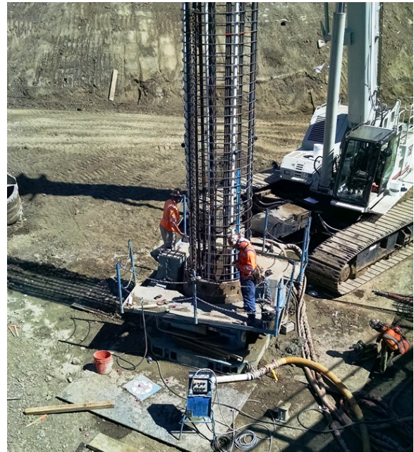
Rebar cages for Railroad Bridge columns

Two separate railroad bridges will be erected to rebuild main tracks 1 and 2. These tracks will restore the corridor for Caltrain, Amtrak, ACE passenger trains and Union Pacific railroad freight trains.