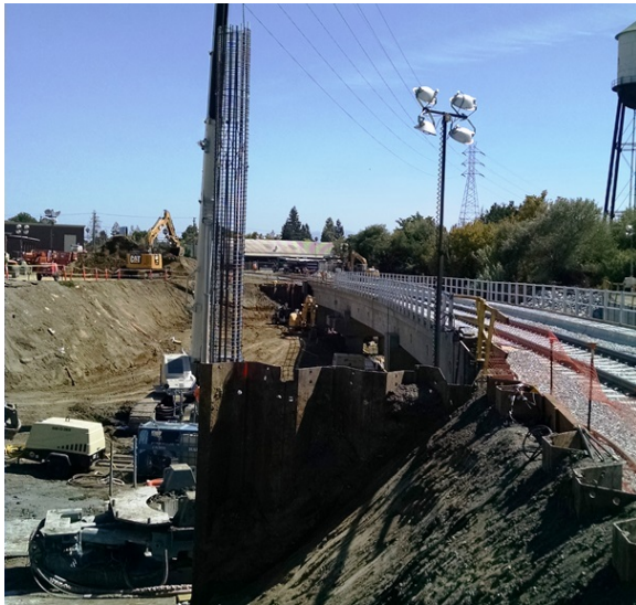
Los Gatos Creek Bridge Replacement

After constructing a temporary track to maintain train service south of the San Jose Diridon Station, Caltrain demolished the railroad bridge over the Los Gatos Creek taking great care to avoid contamination into the creek.