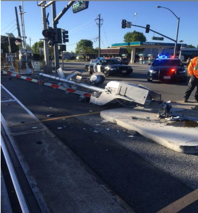
Crossing gate destroyed