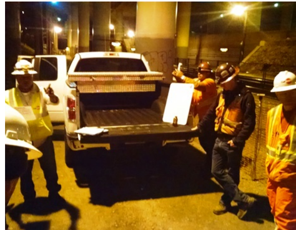
RWICs Conduct Job Briefings before Work Starts

Caltrain regards safety as a priority for all workers and passenger train operations.