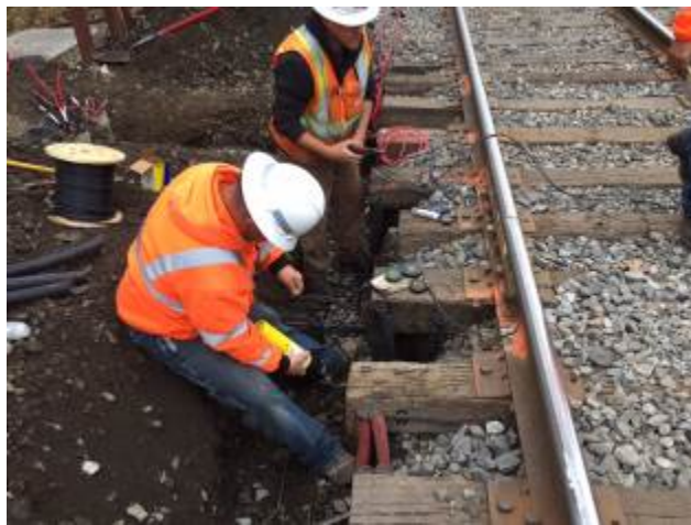
Signalmen replace track leads at reconstructed grade crossing