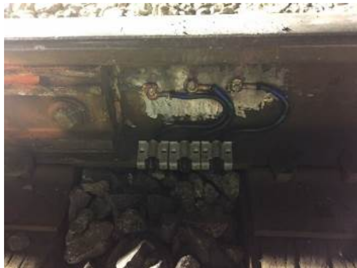
The completed signal project at Glenwood Avenue