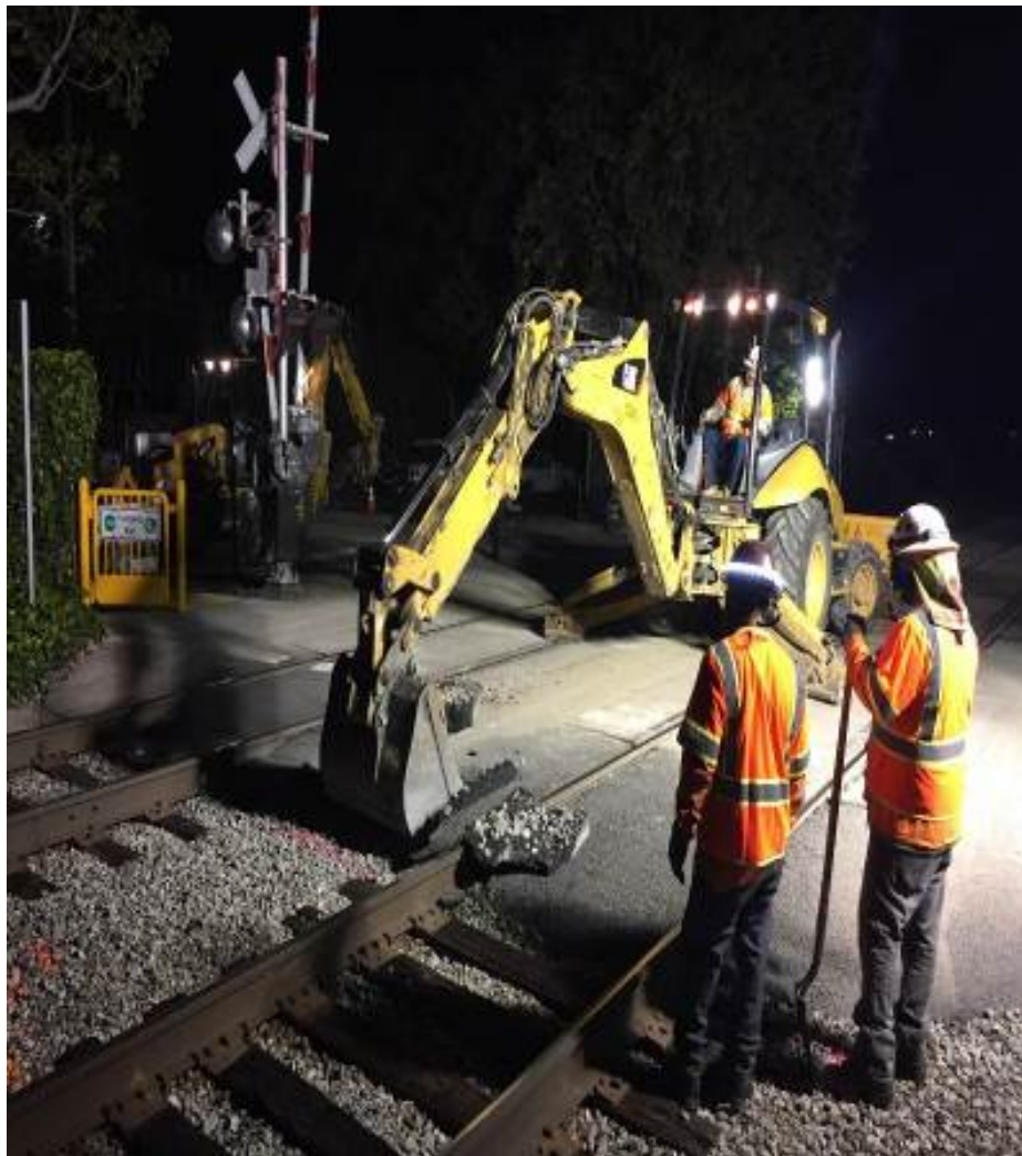
Friday night project start – removal of asphalt/concrete

Conducted grade crossing maintenance work at Glenwood Avenue in Menlo Park during the weekend of April 21 st to 24 th . This required closure of the grade crossing to conduct this state of good repair work. The work included resurfacing and realignment of both tracks. This provides a safer and smoother grade crossing for bicyclists, pedestrians, and vehicles.