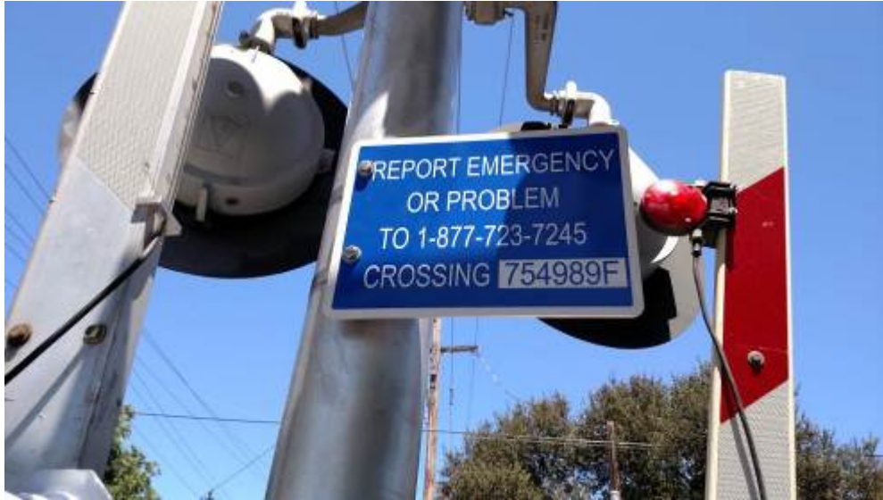
Close up view of the new sign