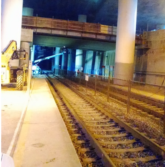
22 nd Street Station - Bridge Work Over Tracks

Caltrain safety representatives randomly monitor night work that is conducted over tracks to ensure safety of workers, tracks, and equipment.