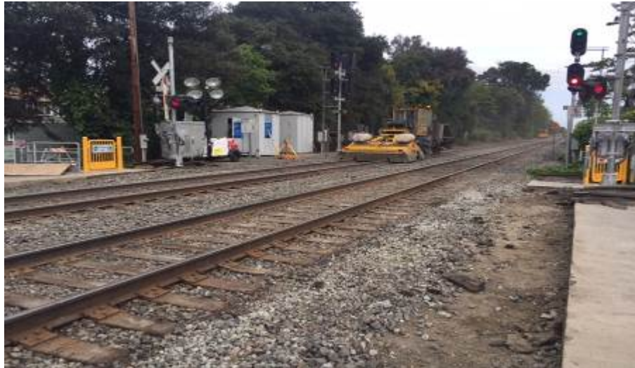
Saturday – surfacing the track