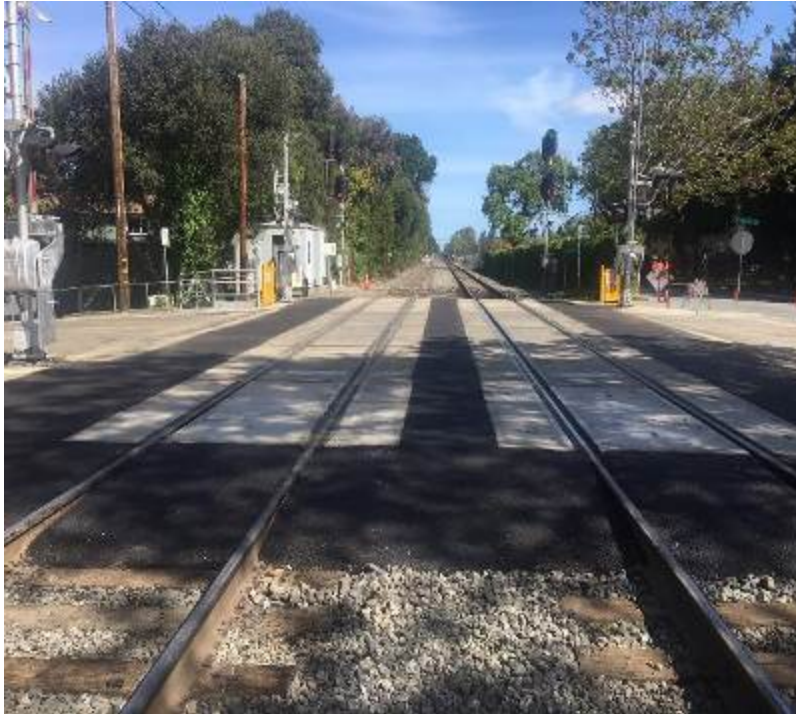
Sunday afternoon – Glenwood Avenue is re-surfaced and ready