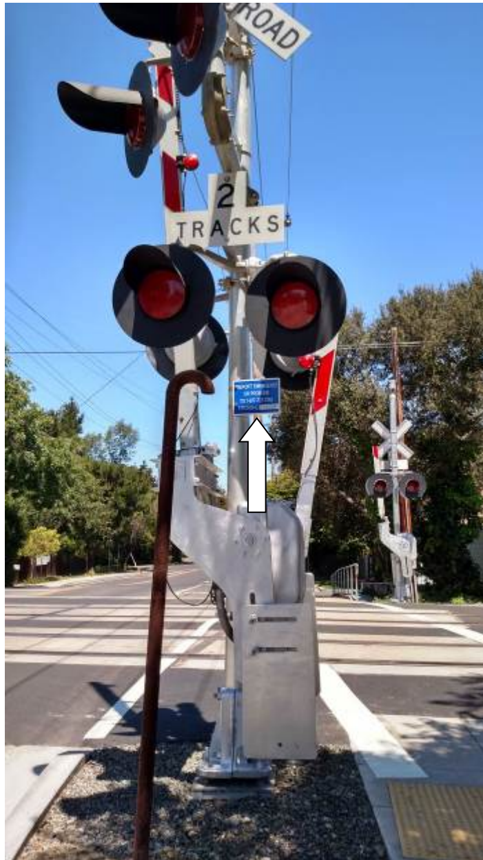
Glenwood Avenue in Menlo Park (MP 28.45) facing east direction

Caltrain commenced the installation of FRA mandated Emergency Notification Signs (ENS) at all 42 Grade Crossings. One sign needs to be installed on both the west and east approaches of every grade crossing that Caltrain maintains. A total of 84 signs will be installed over the next couple of months to comply with new requirements and provide the public a phone number in the event on an emergency or problem near a grade crossing: 1-877-723-7245 (1-877-SAF-RAIL).