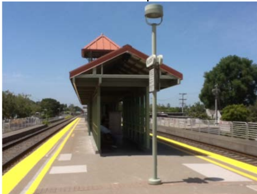
Repainted 6-inch tactile tile, yellow line, and platform markings