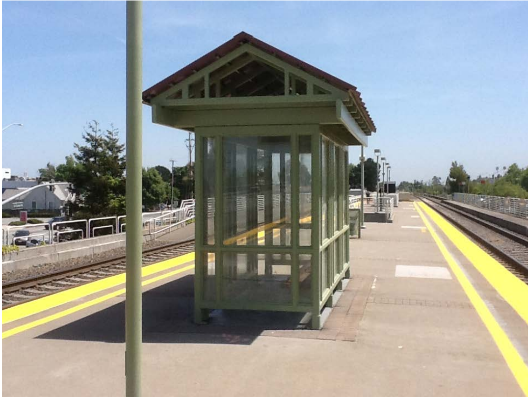
Prepared and painted the passenger shelters inside and outside