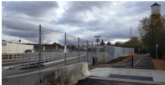
Fence separates bike riders and pedestrians from active tracks

The Los Gatos Creek Bridge Replacement project completed the fence work around the three track bridges and also completed a renewed bike and pedestrian trail.