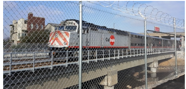
Caltrain train north bound on Main Track 1

The new bridges of pre-stressed/pre-cast concrete replaced the original two-track bridge built in 1935. Environmental impacts were minimal if any due to special measures in place including monitoring by environmental representatives from start of construction to finish.