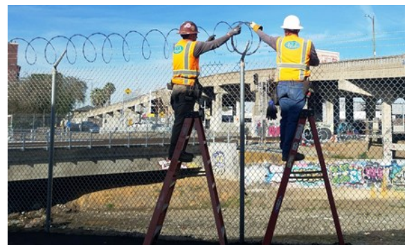
Fence was replaced on both sides of track bridges

The fence was rebuilt with some additional security assessment improvements. The fence had been removed on both sides of the tracks from the Auzerias grade crossing to the San Carlos above-track bridge. This was due to the need for large machines such as multiple cranes that placed large bridge beams and pre-cast abutments.