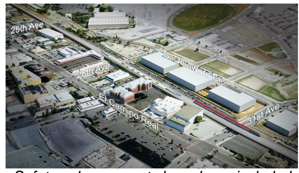
Safety enhancements have been included

The Hillsdale Station will be relocated and newly built as a center platform station (like the Belmont Station) between 31<sup>st</sup> and 25<sup>th</sup> Avenues in San Mateo, California. 28<sup>th</sup> and 31<sup>st</sup> Avenues will soon have grade crossings as a result of the recent residential and commercial construction on the east side of the tracks.