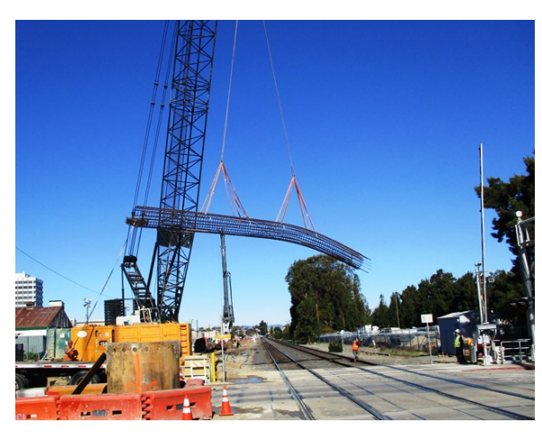
Crane work near 25<sup>th</sup> Avenue

The Hillsdale Station will be relocated and newly built as a center platform station (like the Belmont Station) between 31<sup>st</sup> and 25<sup>th</sup> Avenues in San Mateo, California. 28<sup>th</sup> and 31<sup>st</sup> Avenues will soon have grade crossings as a result of the recent residential and commercial construction on the east side of the tracks.