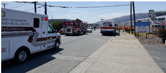
Medical, Fire, and bus support provided

This emergency preparedness and response exercise was conducted at the Caltrain Bayshore Station, which is located within both San Francisco and San Mateo counties. The train was staged on both counties on the adjacent tail track. Using the tail track provided protection for all exercise participants segregated from revenue service trains on the main tracks.