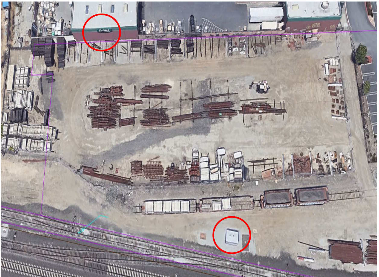
Redwood yard before relocation. Picture shows track materials including rail, concrete ties, switch ties, and other track components.