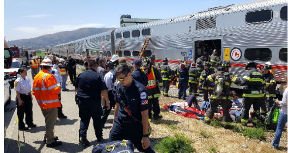
Staged rescue and treatment area

Fire Fighter emergency response practices vary between the SFFD and NCFA, so this provided the opportunity to work collaboratively and learn the others' response methods. As such, emergency responders representing both counties participated and worked well with a sense of urgency.