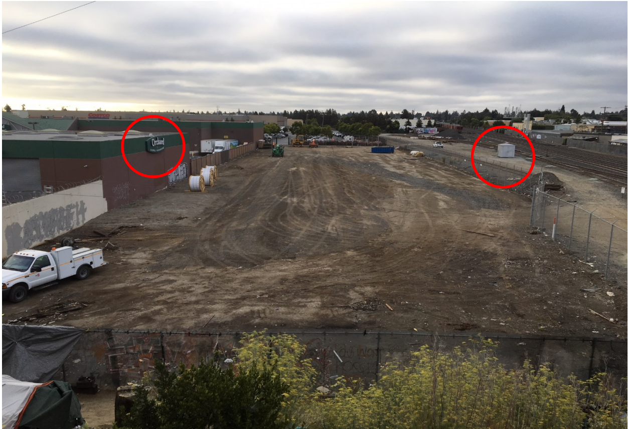
Redwood yard after material has been moved. Note: red circles to match locations from bird's eye view