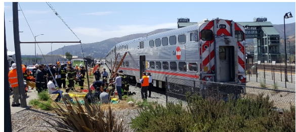
Evacuation and medical care – SF County

Also, a Traffic Management Plan provided by the District's Transit PD was also incorporated into this exercise to manage traffic and minimize disruption to local community traffic.