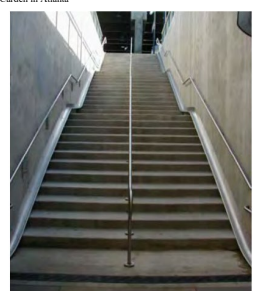
Figure C-7: Lawrence Caltrain station stairway channels