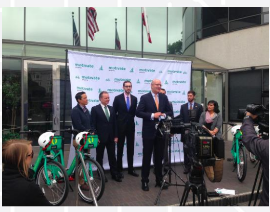
The Bay Area's bike share will be the largest bike share per-capita in the country when expansion is complete.