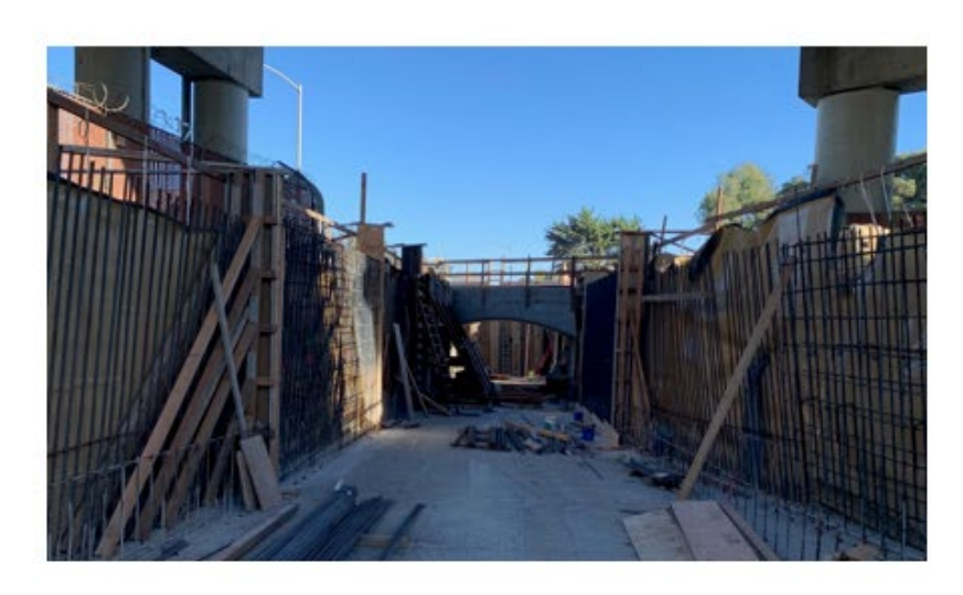
Construction of West Station Access