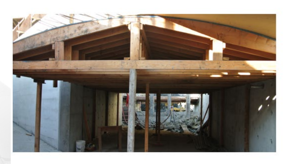
Arch Formwork to Platform and Underpass