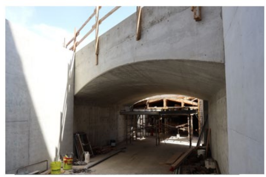
Construction of Ramp 2 Access to Platform