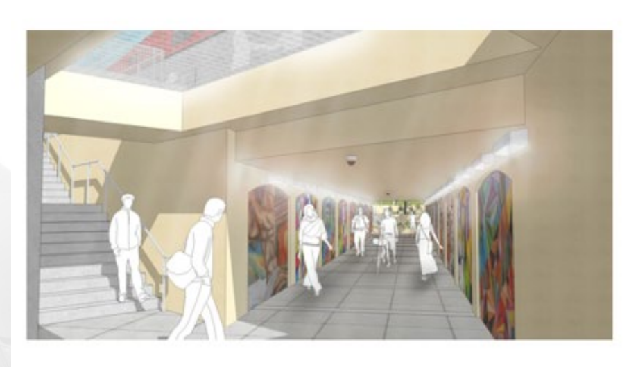
Rendering of Pedestrian Underpass