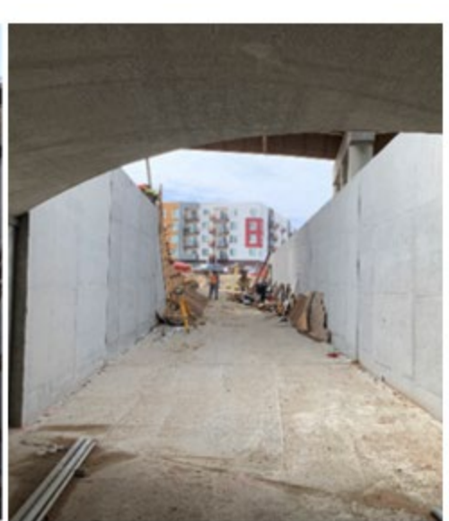
Ramp 3 Construction (West Station Access)