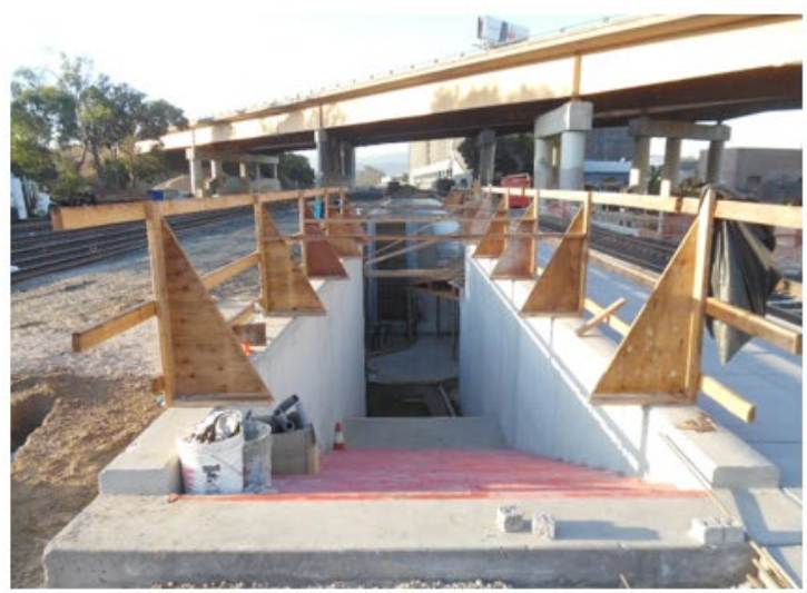
Stair 2 Access to Platform