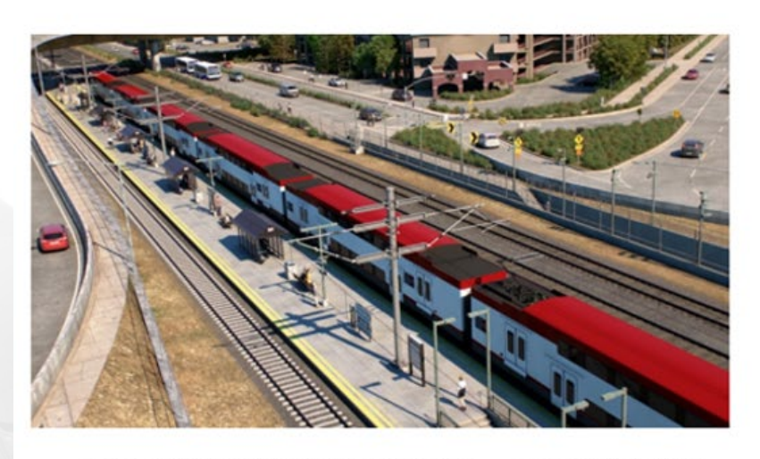
Rendering of Center Platform – Looking North