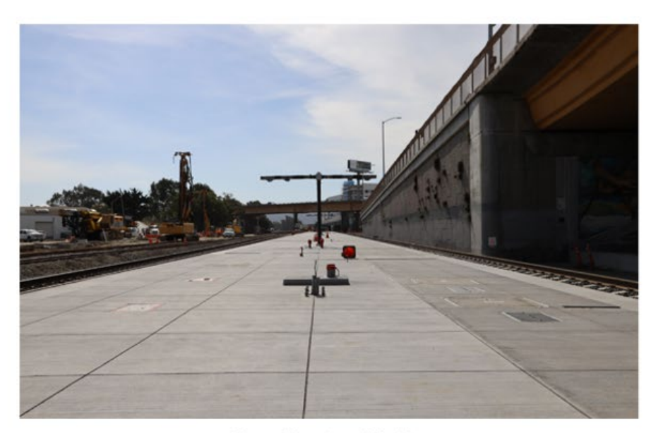
New Center Platform