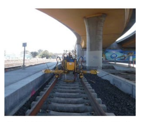
New MT2 Track - At Center Platform