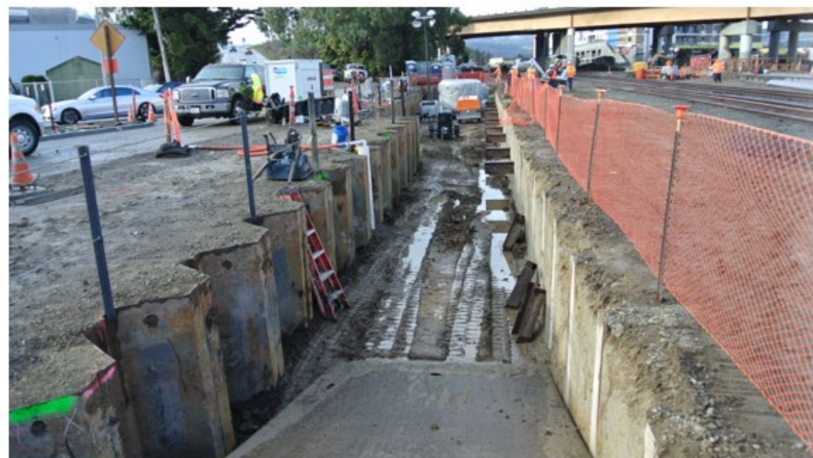
Ramp 1 Construction – Shoring (East Station Access)