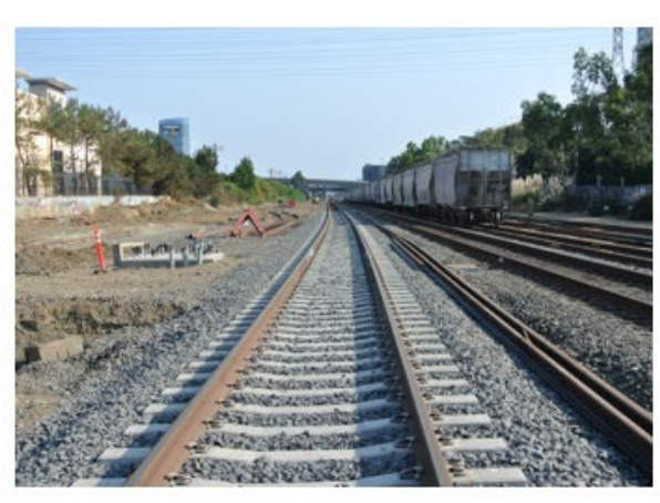
New MT2 Track - Looking North