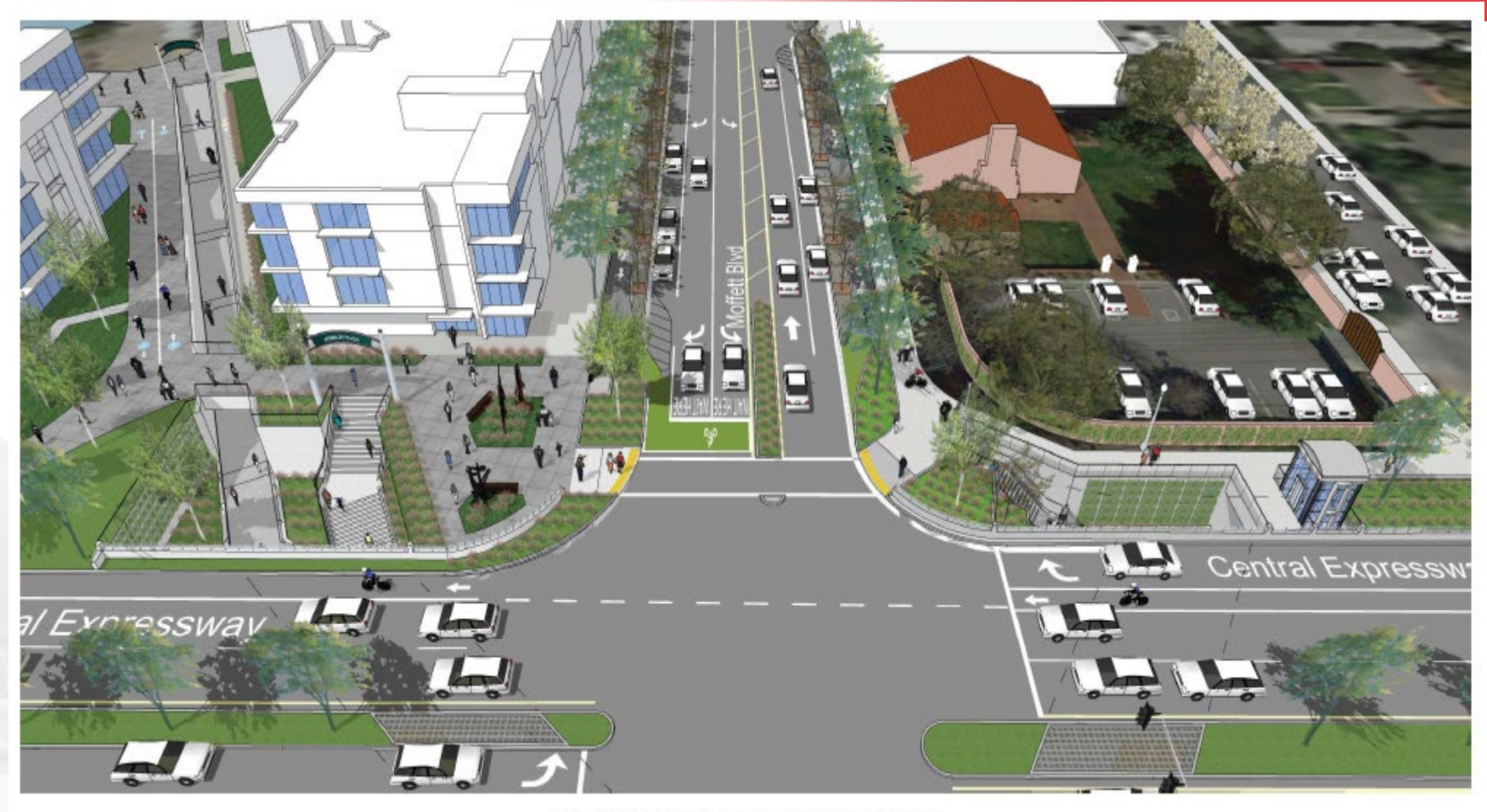
North side of Central Expressway and Moffett Boulevard Intersection (planned)

North Side of Central Expressway and Moffett Blvd Intersection