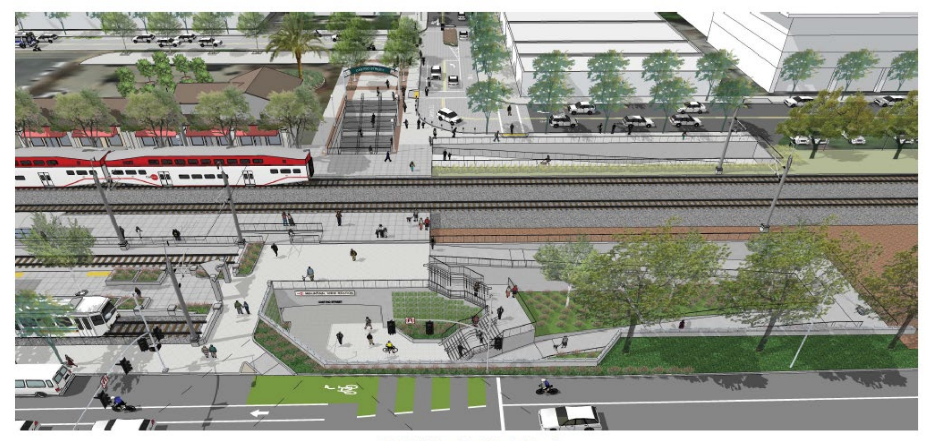
Castro Street looking south towards Downtown (planned)