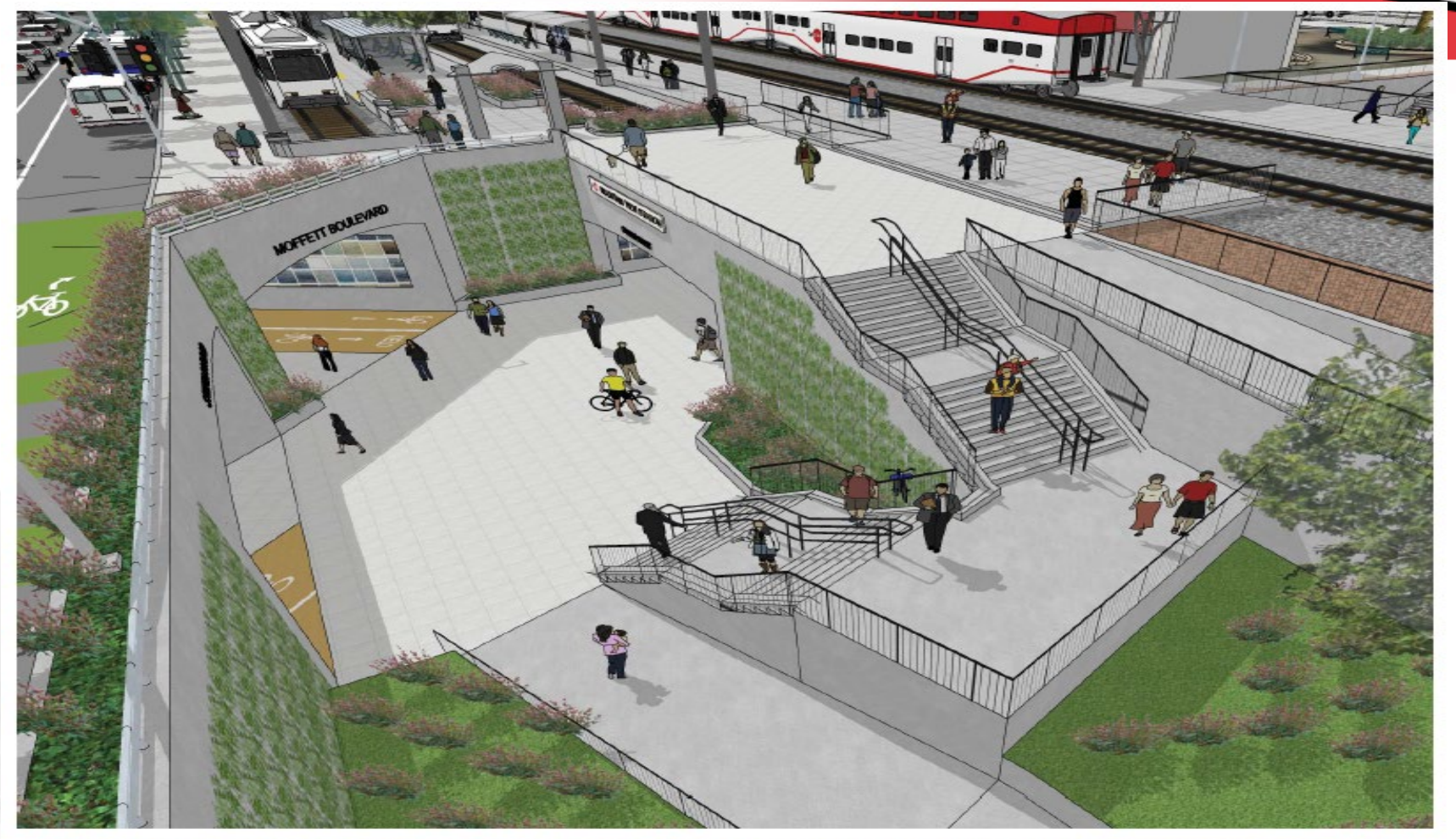
Stairs and ramps should be gracious in form and generous in dimension, making the transition between undercrossings, the Concourse, and platforms convenient and pleasant.

Transition between Undercrossing, Platform and Concourse Area