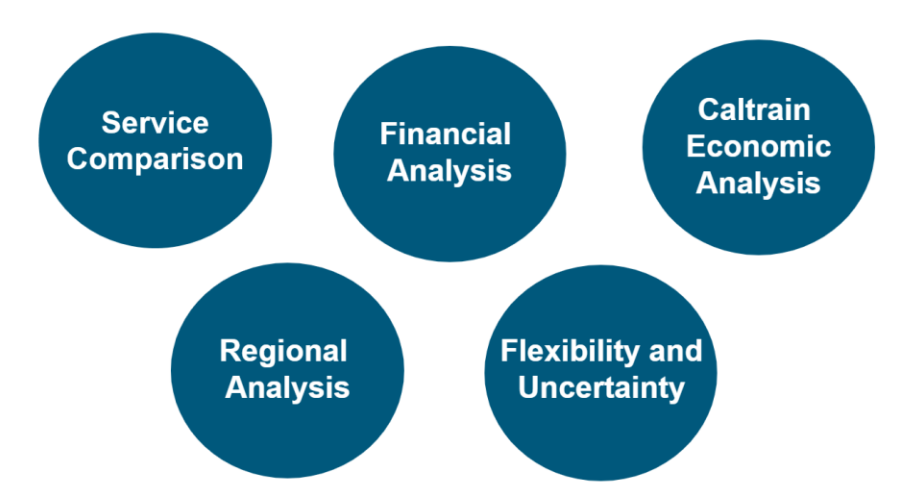
Figure 4 - Areas of the Business Case Analysis

The detailed illustrative growth scenarios developed through the service planning process were used to model ridership, specify and estimate the costs of required capital investments, and to model detailed operating costs. These outputs were then used as the basis for developing a "Business Case" analysis of each scenario. The Business Case analysis is a structured framework that helps analyze and weigh the costs and benefits of the different options. The analysis examines five areas, each of which is presented in detail in the accompanying presentation and is discussed briefly in this memo.