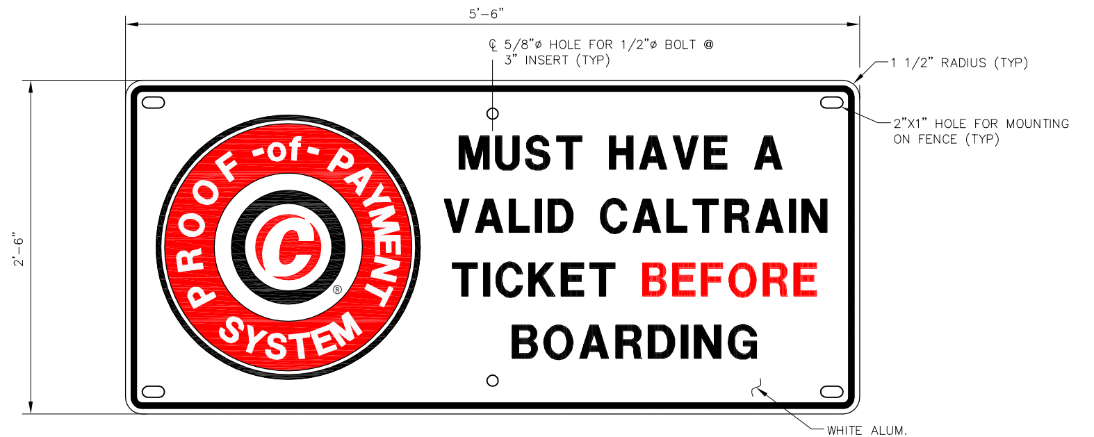
POP SIGN ON FENCE (POP-2B)