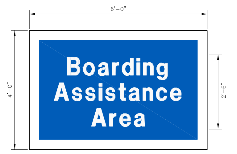
BOARDING ASSISTANCE AREA (BA-3)