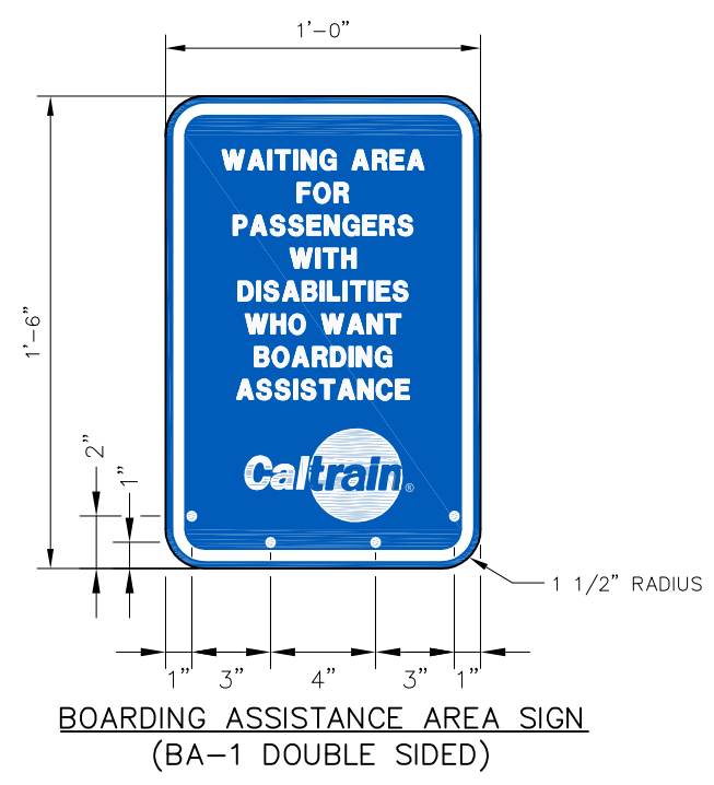
BOARDING ASSISTANCE AREA SIGN (BA-1 DOUBLE SIDED)