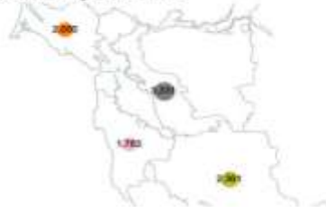
Conversations By Area Code

Conversations in Area Codes 415, 510, 650, 408