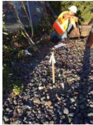
Potholing – to identify utilities