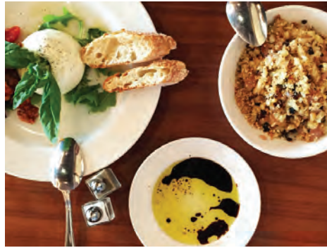
Round 1- Cavolfiore & Burrata

DOPPIO ZERO -As close as Caltrain gets to Italy