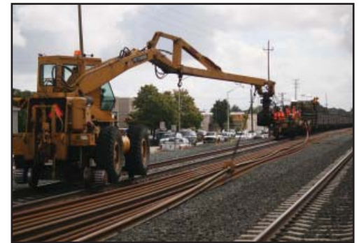
This form of rail is very strong, gives a smooth ride and needs less maintenance.

The rail will be used for upcoming construction projects, such as the renovation of the Santa Clara station and the replacement of four bridges in San Mateo, as well as routine maintenance work.