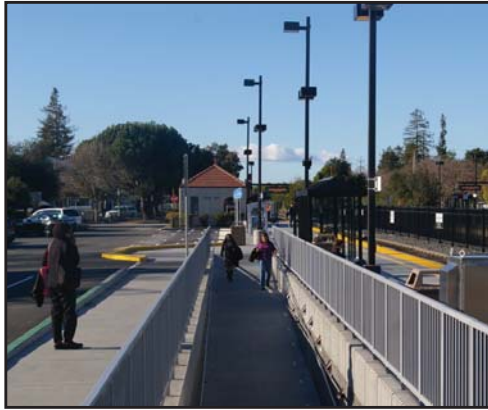
The California Avenue station features a new pedestrian underpass.

As part of the project to improve safety at the popular station, the at-grade crossing for customers with mobility impairments has been removed and replaced with a safer, pedestrian underpass that allows people who use wheelchairs and other mobility devices to get easily from one platform to another.