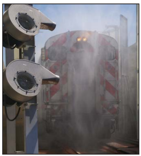
Water from the train washer is recovered and recycled.

People working or living near the San Francisco station or the San Jose maintenance facility may not be aware that Caltrain has expanded its ground power and compressed air systems at these facilities. Before this project was completed, crews had to rely on the locomotives' engines for power while performing routine maintenance work on trains. Now, crews can plug into 480 volts of ground power, allowing the locomotives to be shut off.