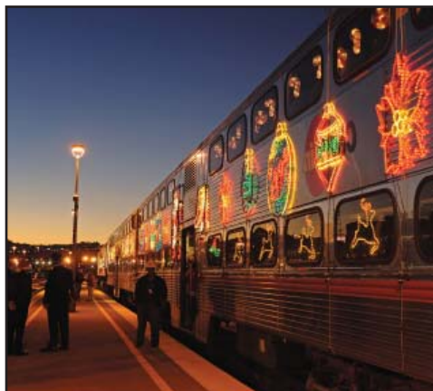
Since 2001, more than 40,000 toys have been collected for needy children.

In conjunction with the U.S. Marine Corps Reserve's Toys for Tots program and the Salvation Army, the Caltrain Holiday Train received a total of 5,309 donated toys and books – up 27 percent from the 2007 toy count of 4,179 - and nearly $2,250 in cash donations.