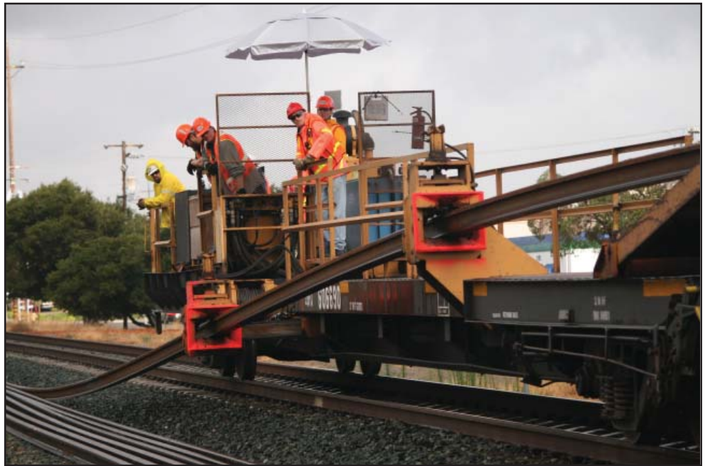
A special car was needed to unload the 1,600 lengths of rail along the corridor.

Because there are few joints, this form of rail is very strong, gives a smooth ride and needs less maintenance. The rail was manufactured in Pueblo, Colo. and shipped on a special train to Caltrain.