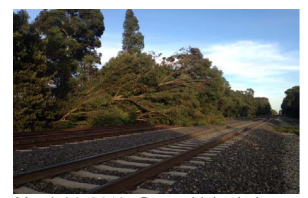
March 26, 2016 - Due to high winds on the Right-of-Way, a 90-foot Eucalyptus Tree fell across the tracks just south of the Millbrae Station. A MOW employee notified dispatch, and all trains in the area were held. Trains used singletrack around the tree until removed.