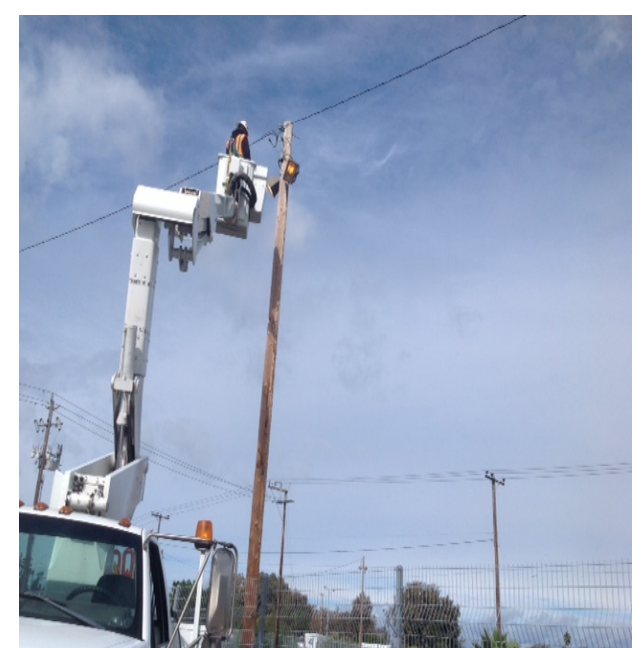
Repaired lights north of Hayward Park station along pathway on the west side