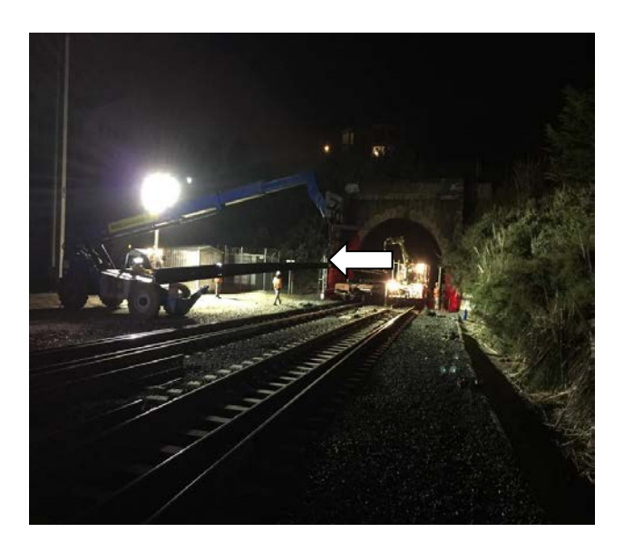
Unloaded new switchpoint before installation at CP Tunnel