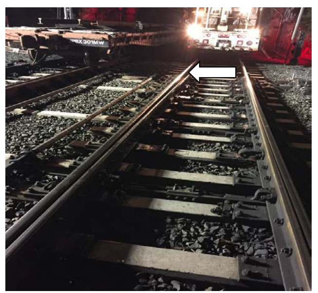
Replaced stock rails at CP Tunnel Stations