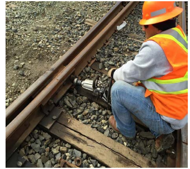
Replaced torch cut bolts with new bolts, washers & nuts