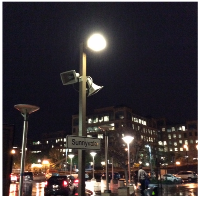
Replaced 17 existing ballast and lights with Light Emitting Diode (LED) lights along the platform at Sunnyvale station; LED lights are now furnished with ballast and this will simplify future replacements.