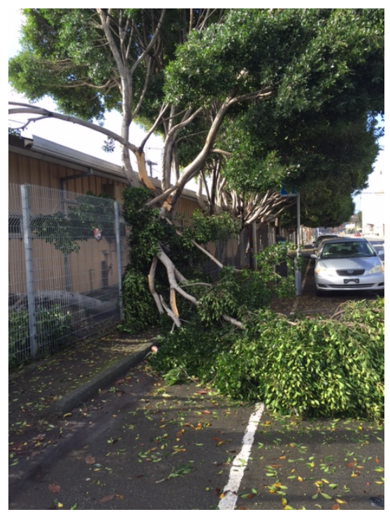
Removed a tree that fell on the Crew Facility at 5<sup>th</sup> Street & Townsend in San Francisco.