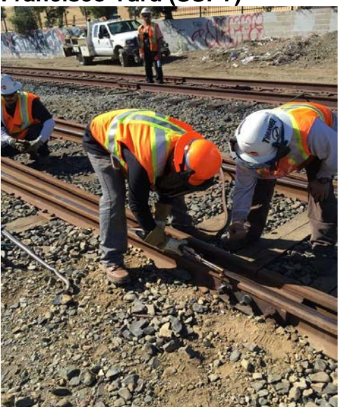
Torch cutting frozen bolts in SSF Yard