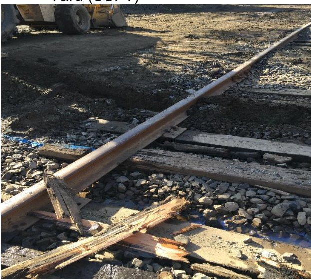
Replacing rotted ties no longer properly supporting the rail in SSFY

Installed 28 new switch ties and 44 – 9 foot wooden ties in South San Francisco Yard (SSFY)