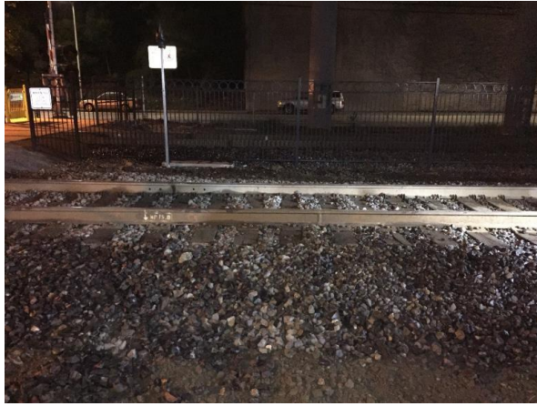
Installed new ballast, tamped ties, restored track surface