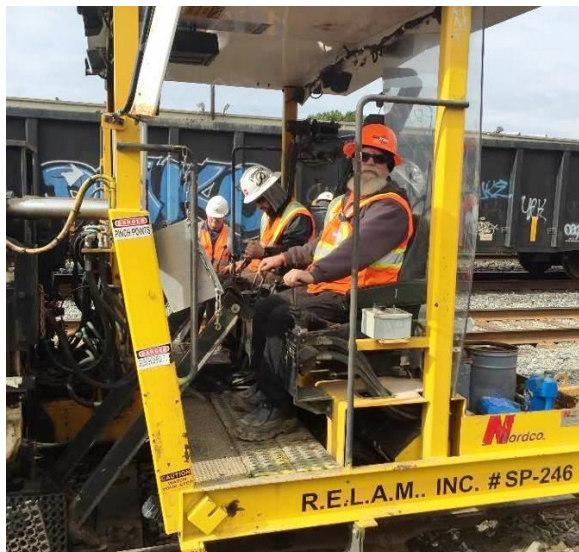
Personnel & equipment used in the tie replacement work in SSFY