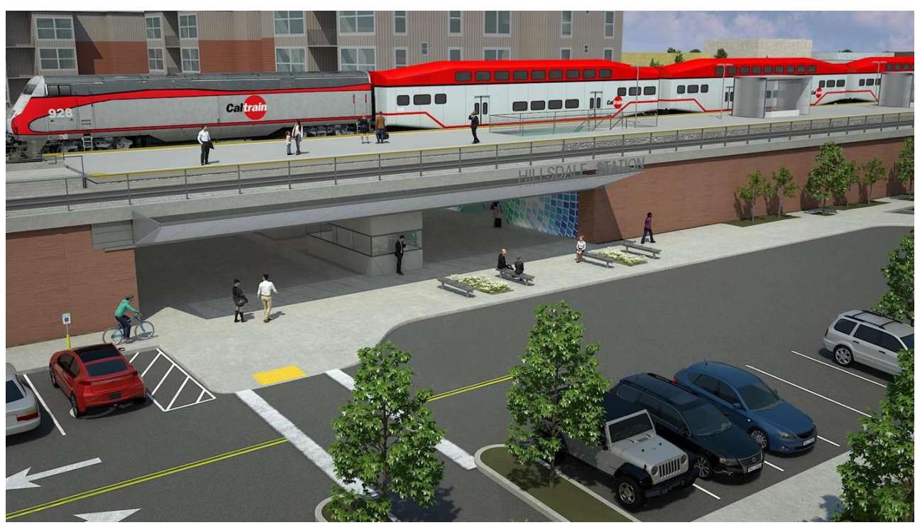
Artist rendering of the new Hillsdale Station