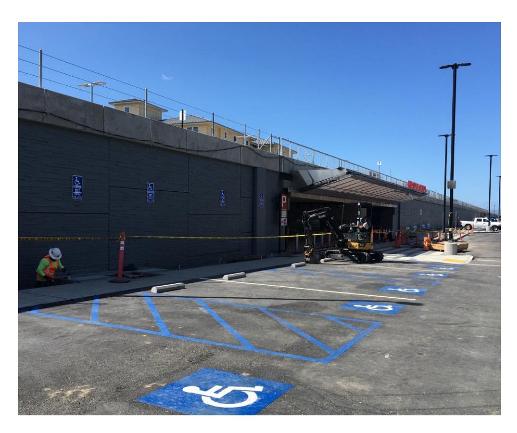
Southern Parking Lot & Underpass to Ramp Entrance