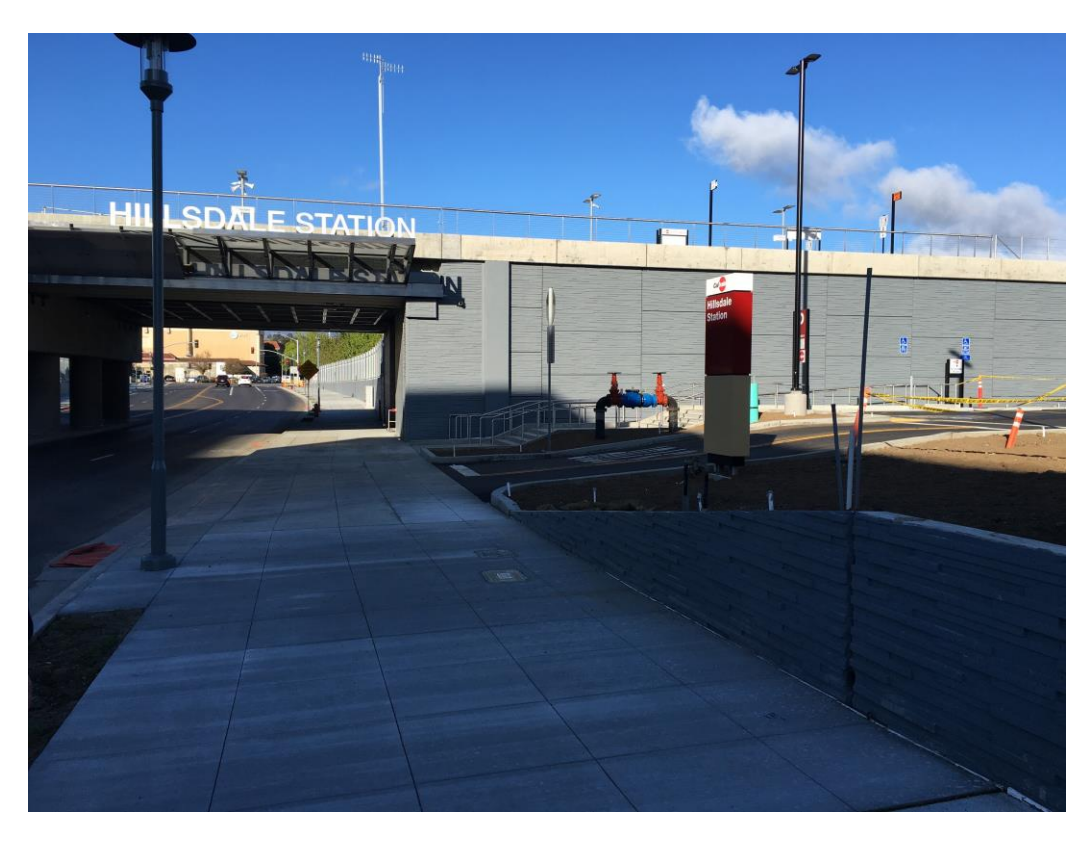
28th Avenue Sidewalk & Northern Parking Lot to Ramp Entrance