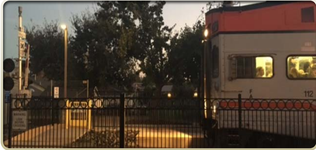
Pedestrian Gates recovered in the up position allowing passengers to cross the tracks