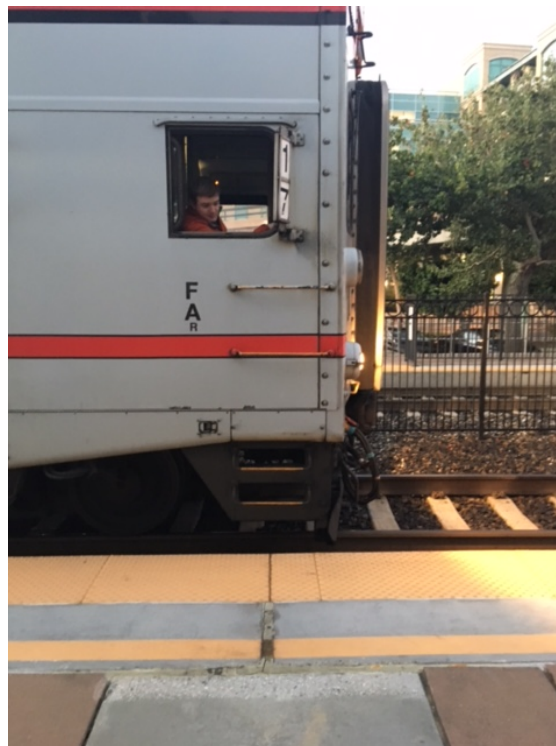
Aligning the Bombardier consist with the posted Spot Cab Sign