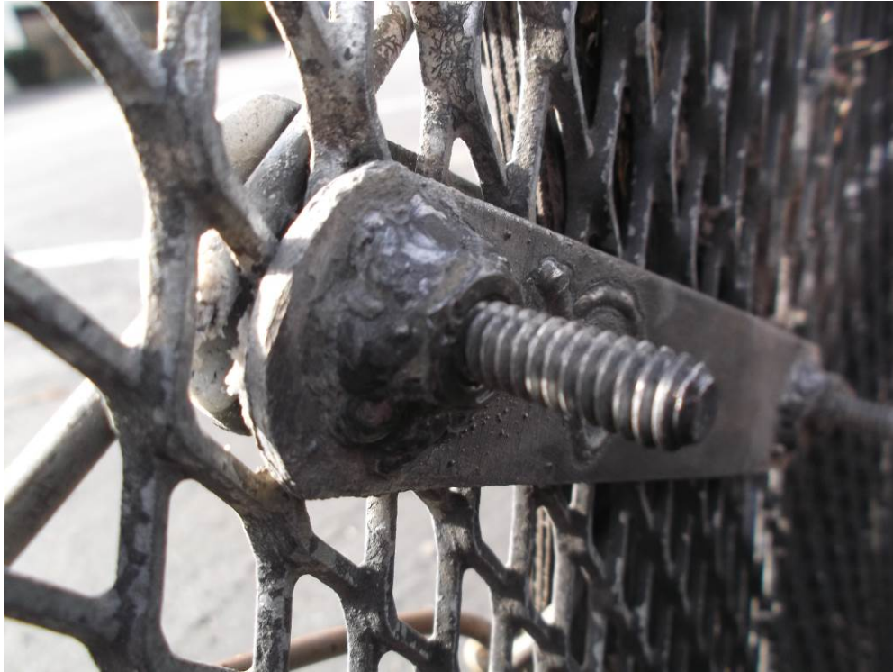
The completed work