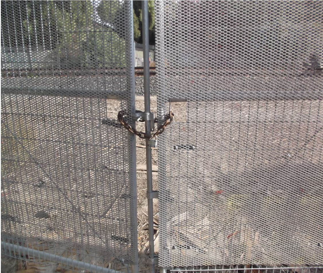
Expanded Metal Panels added to Welded Wire Gate