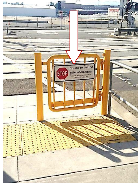
New sign (facing field) makes front & back uniform