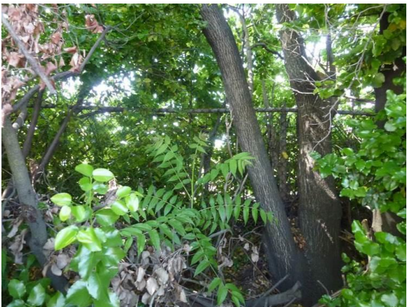
Before: Dense vegetation and existing four-foot fence (typical)