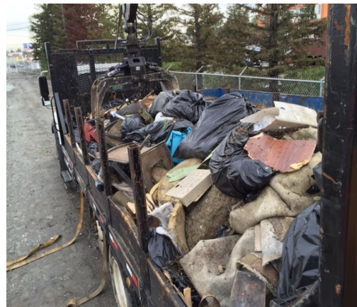
A truck load of debris removed from encampment