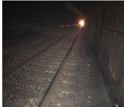
Completed surfaced track in the Tunnels