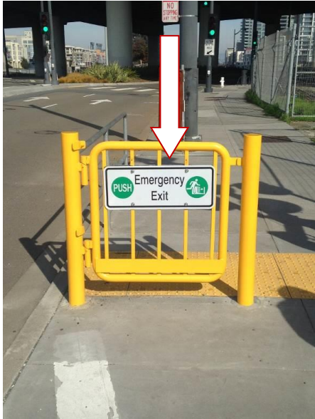
New sign (facing track) adds a directional pictograph