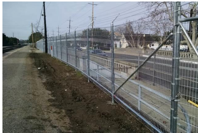
After: New nine-foot six-inch welded wire fencing near Stanford Stadium