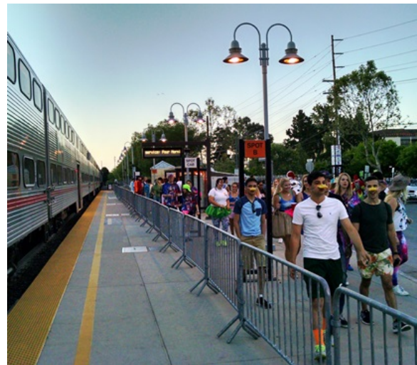
Palo Alto Station channeling set up

Caltrain provided two 10-railcar and two 6-railcar trains prior to normal Sunday service so the riders would arrive in time for the 8 a.m. race commencement.