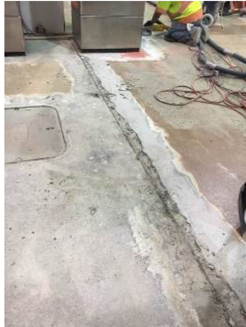
Removal of the existing flooring; had multiple layers built up over the years