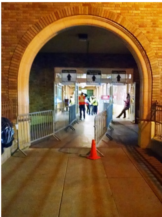
San Jose Diridon Station channeling set up

Safety trained Caltrain Ambassadors assisted thousands of passengers at the San Jose Diridon and Palo Alto stations.