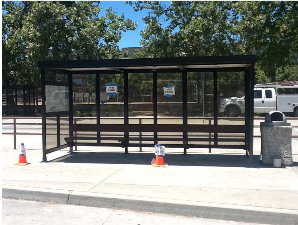
Bus shelters painted

Training focused on the following areas: