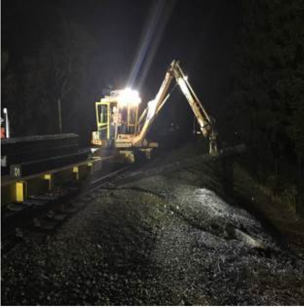
New wood switch ties installed