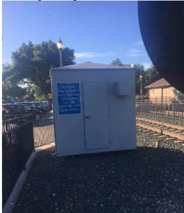
Menlo Park Pedestrian Crossing