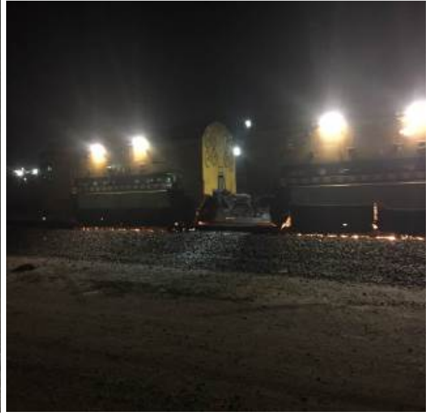
Rail grinder in operation at night