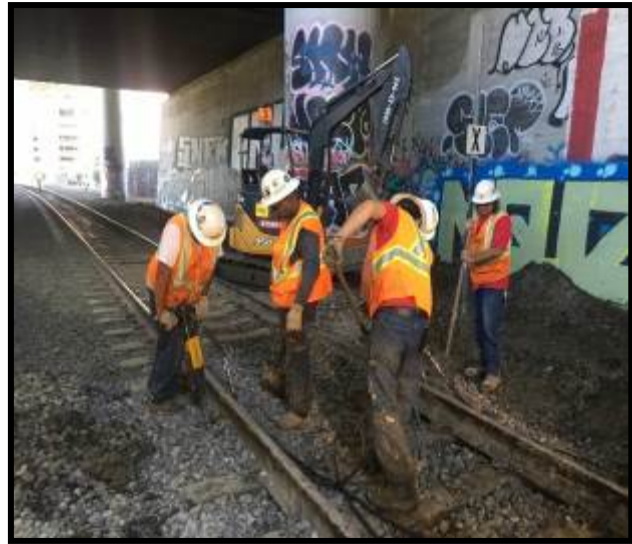
Removed & replaced the fouled ballast and restored the drainage ditch to let the water flow