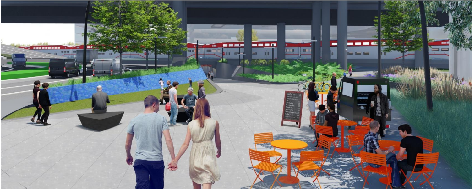
Rendering of Completed West Plaza Entrance