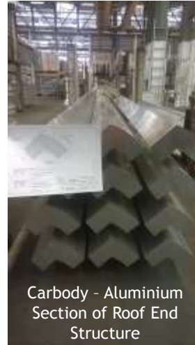
Carbody - Aluminium Section of Roof End Structure