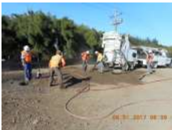
Test pile installation in preparation for foundation installations