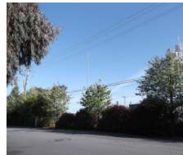
Base Station in Right-of-Way

A project web page, hotline, and email address to receive project comments and questions are available throughout the installation period. Project informational materials, such as factsheets, FAQs, and presentations, are available online, and updates are provided regularly to share installation information and key project milestones. Additional local outreach efforts may occur based on the nature and/or amount of time needed to complete work in specific locations. Installation impacts to surrounding communities and the public is expected to be minimal. Most installation activities will occur completely within the Caltrain right-of-way.