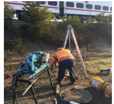
Fiber Optic Cable Installation