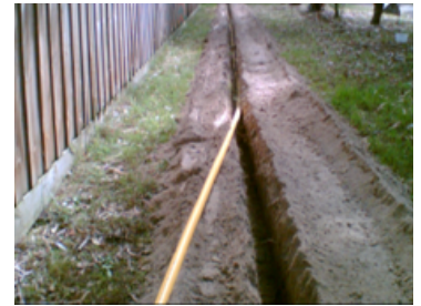
Trench (42" deep x 9.5" wide)

Boring is required at many of the approximately 42 street crossings along the corridor. Staging and implementation of boring operations occurs mostly within the Caltrain right-of-way. Caltrain's intent is to avoid impacting vehicular crossings to the degree possible. Installation along bridges and inside tunnels may require temporary traffic lane closures during off-peak hours.