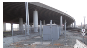
Base Station Hut in the Right-of-Way