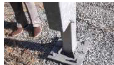
Base Station Foot Print