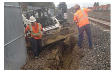
Backfilling Trench with Sand